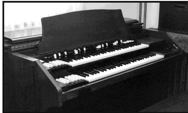
The Hammond RT-3 at DHORA MUSIC.

All tracks on all sections of A Wanderer of the Waste were played on a Hammond RT-3 organ (1960) through a Leslie 145 speaker cabinet (1967). It is often difficult to recognize the sounds that were generated for the piece as coming from a common tone-wheel organ and rotary speaker even though no special effects were added. 47 In fact, several listeners, upon hearing the opening strains of the CD, thought that there was something wrong with their sound equipment.