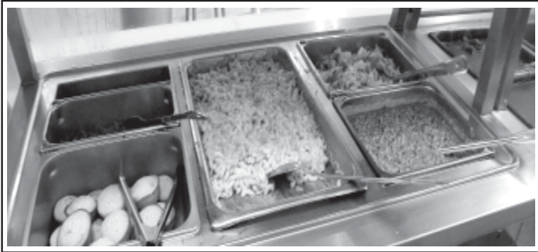
2 sides and lemonade or tea Included