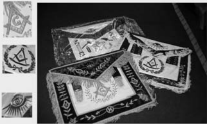
NEVER SEEN BEFORE BRAND NEW APRONS