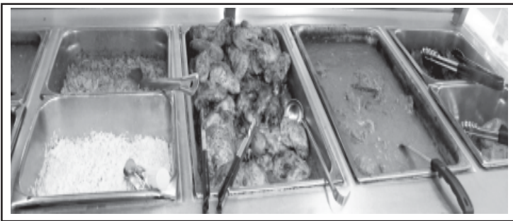
Lunch Specials Everyday 11am to 2:30pm

R&B 3030 Bar & Lounge 115 Rosemary Street, Fayetteville, NC 28301 UNDER NEW MANAGEMENT