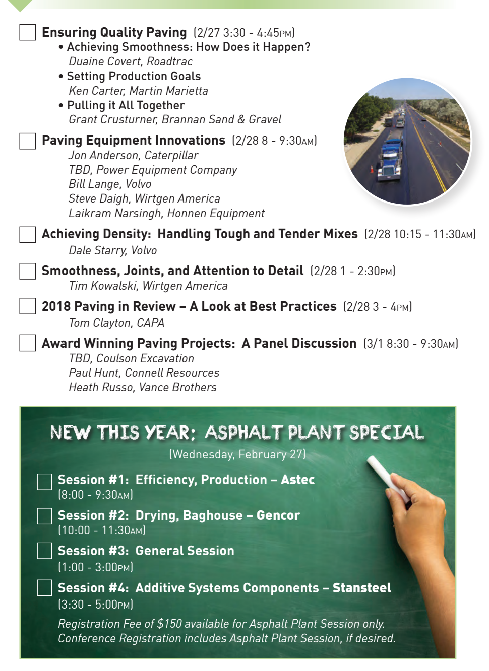
Program is tentative, please continue to check back for changes and updates

The Equipment Show continues to be a major attraction! Visit the Tr