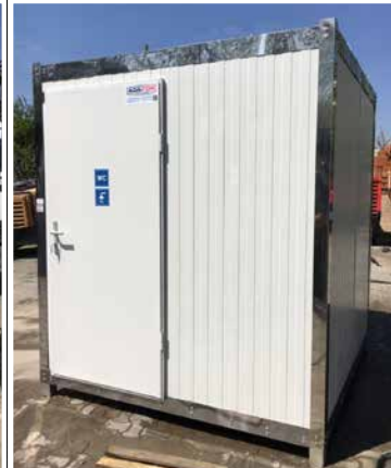
UNUSED - 2017 ADACON T210B PORTABLE BATHROOM