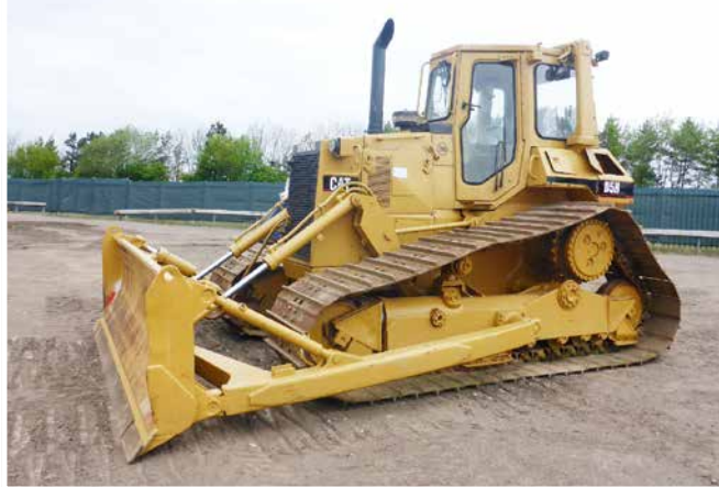
1/2 - CATERPILLAR D5H