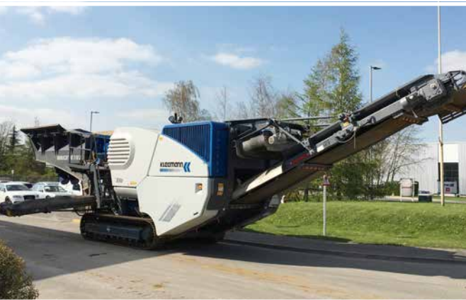
2014 KLEEMANN MC110Z EVO