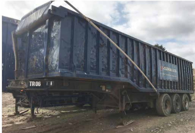
JBC BULK TRAILER