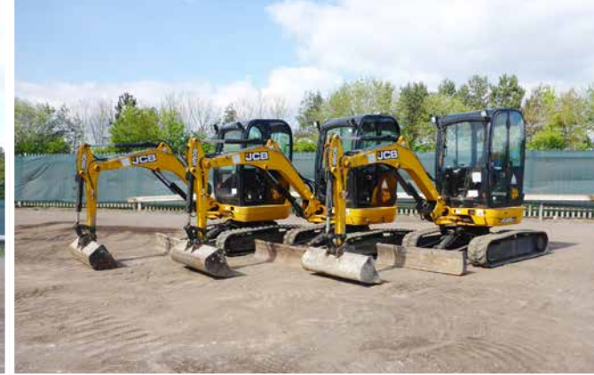
3 / 5 – 2011 JCB 8025