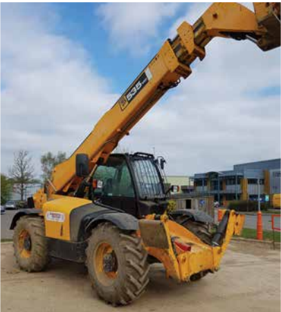
2010 JCB 535-140 4x4x4