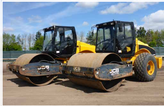
2 – 2010 JCB VM132