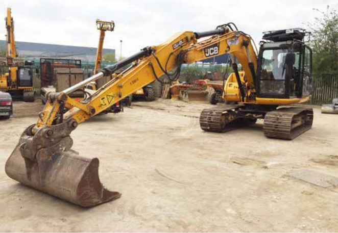
2012 JCB JS130LC