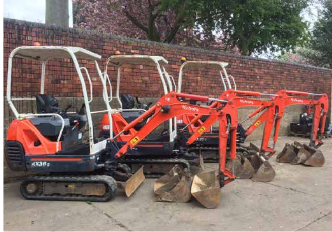
3 - 2008 KUBOTA KX36-3