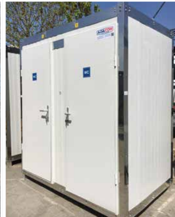
UNUSED - 2017 ADACON T135D PORTABLE DOUBLE TOILET