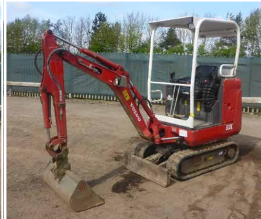
1 / 6 - 2011 VOLVO EC17C