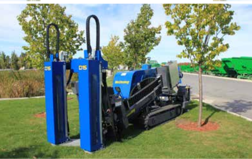
UNUSED – 2016 MCCLOSKEY D15