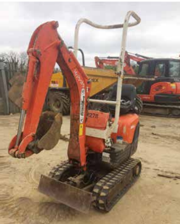
2010 KUBOTA KX008-3