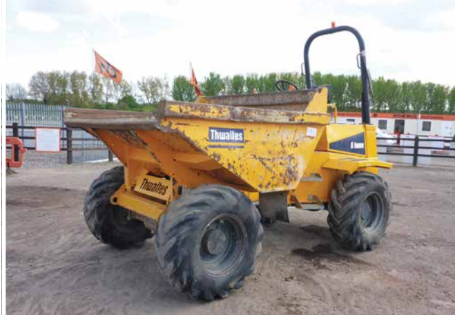
2009 THWAITES 6T