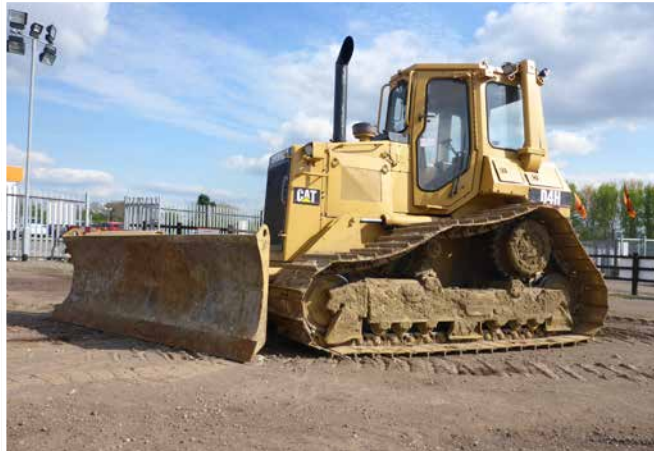
1/3 - CATERPILLAR D4H