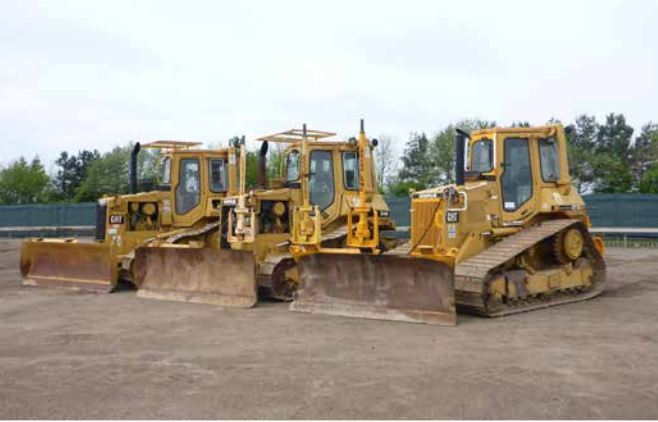
3 / 4 – CATERPILLAR D4H w/ RAILWAY SPEC