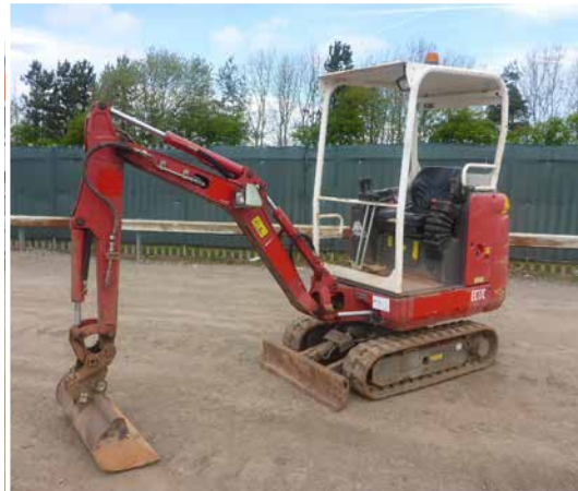
1 / 2 - 2012 VOLVO EC17C