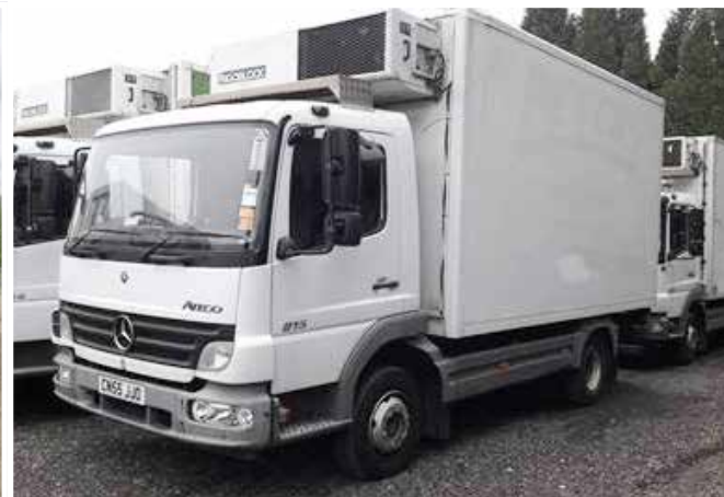
MERCEDES-BENZ ATEGO 815