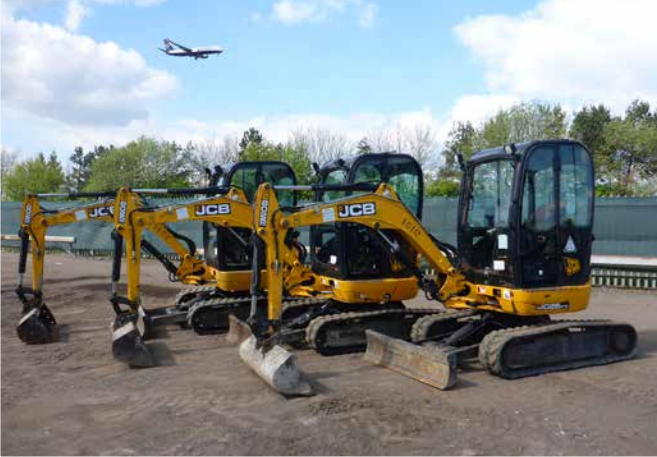
3 - 2010 JCB 8025