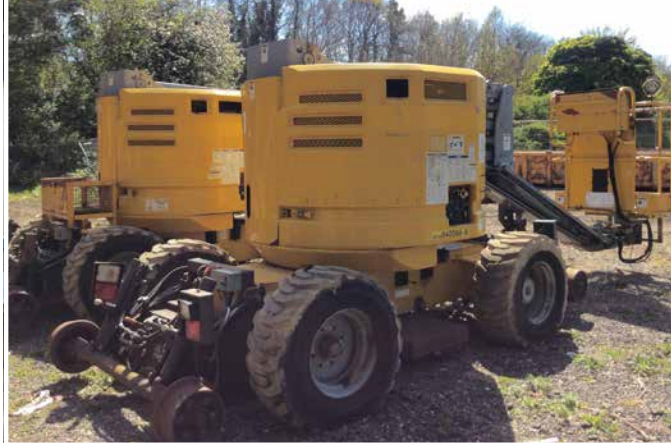
2 - GENIE Z45-22 w/ RAILWAY SPEC