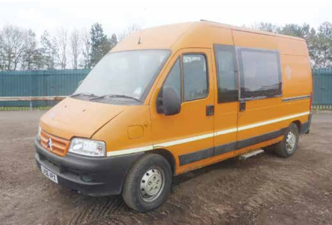
CITROEN RELAY 2.8 HDI