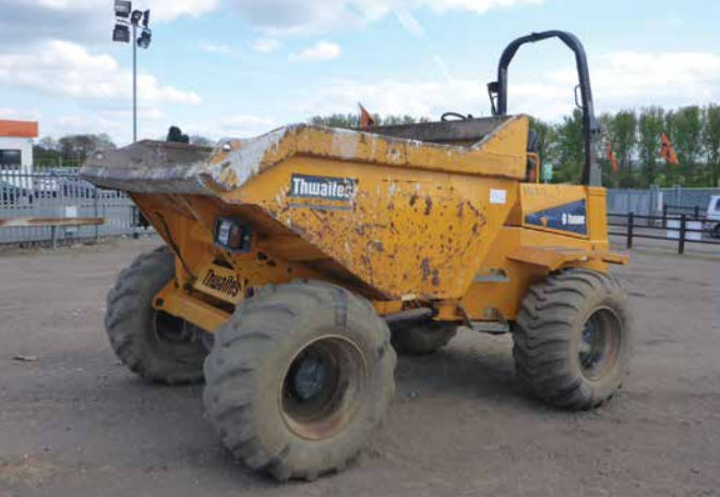
1 / 8 – 2011 THWAITES 9T