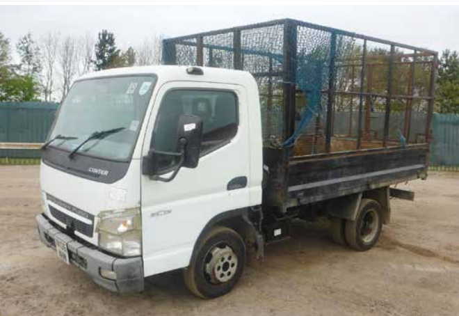
MITSUBISHI FUSO CARTER 3C13