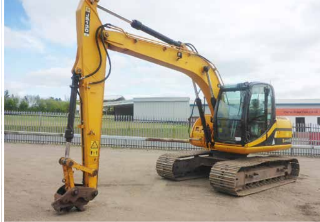
2008 JCB JS130LC