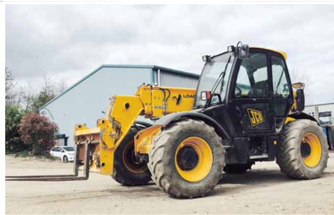
JCB 535-95 4x4x4

» Visit our website for complete and up-to-date listings: rbauction.co.uk