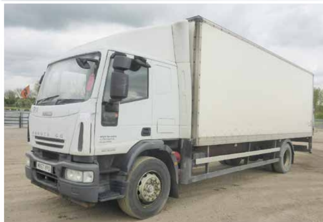
2008 IVECO 180E25