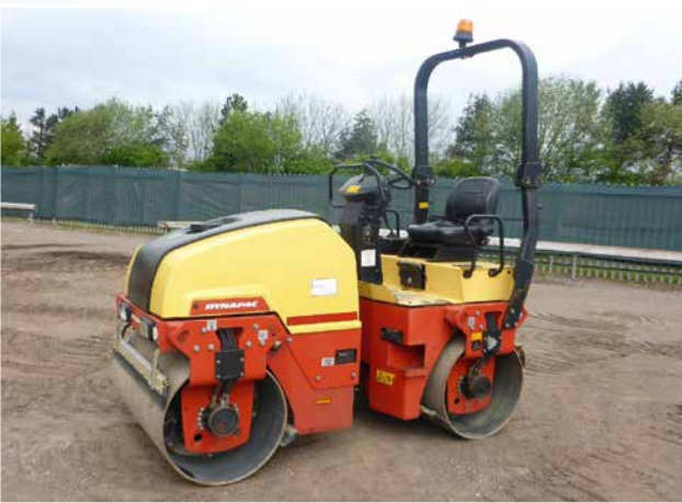
2013 DYNAPAC CC1200