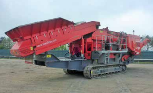
2015 TEREX FINLAY C1540