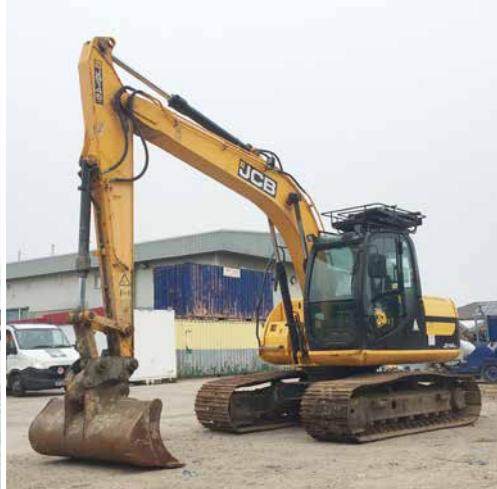
2010 JCB JS145LC