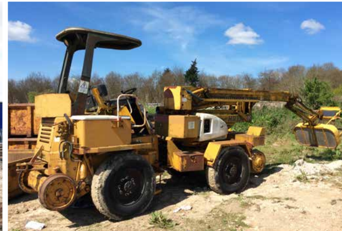
REXQUOTE ACCESS 14 w/ NIFTYLIFT HR15 BOOM LIFT, RAILWAY SPEC