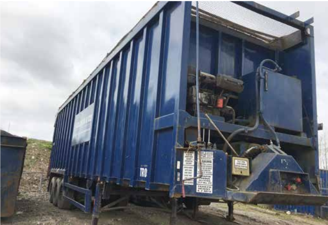
EURO EJECTOR TRAILER