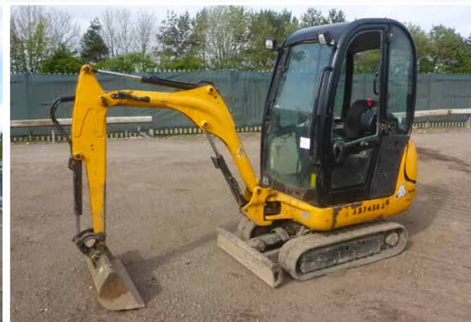
2012 JCB 8016