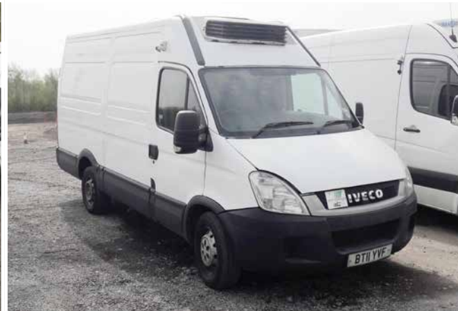
2011 IVECO DAILY 35S13