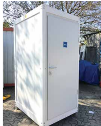
UNUSED - 2017 ADACON T110S PORTABLE TOILET