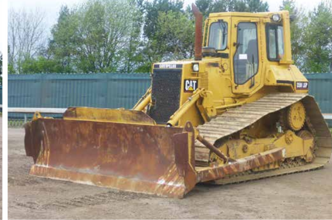
CATERPILLAR D5H LGP