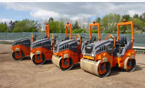
4 – UNUSED – 2016 HAMM HD12VV