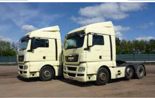
2011 & 2010 MAN TGX26.440