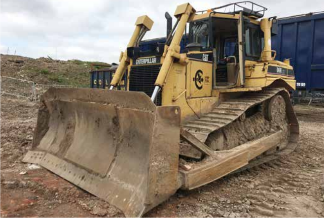
CATERPILLAR D6R XL