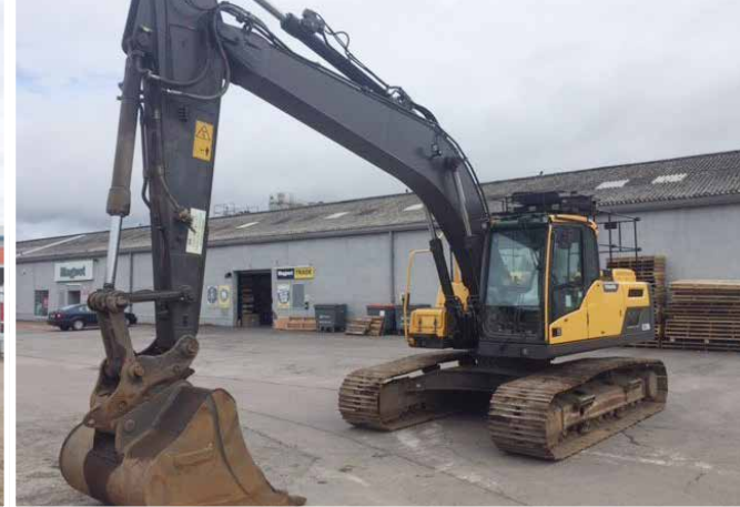
2014 VOLVO EC220DL