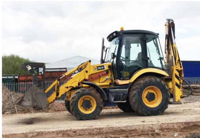
JCB 3CX CONTRACTOR