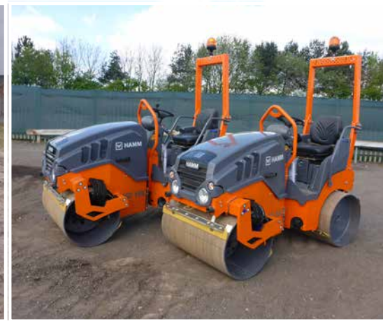
2 - UNUSED - 2017 HAMM HD10CVV