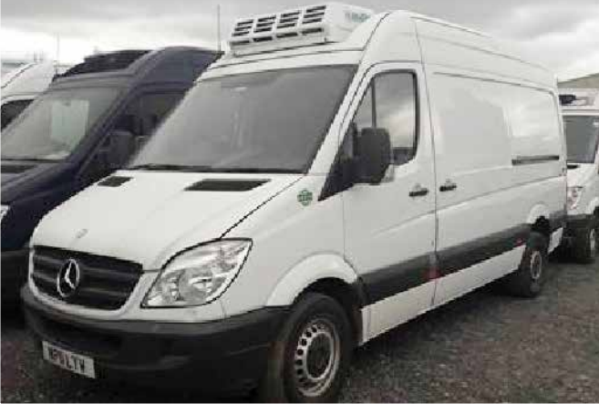
2011 MERCEDES-BENZ SPRINTER 313