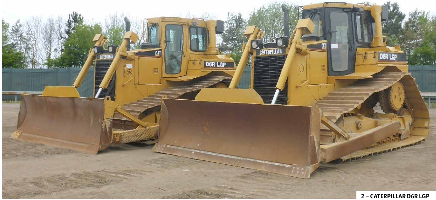
2 – CATERPILLAR D6R LGP