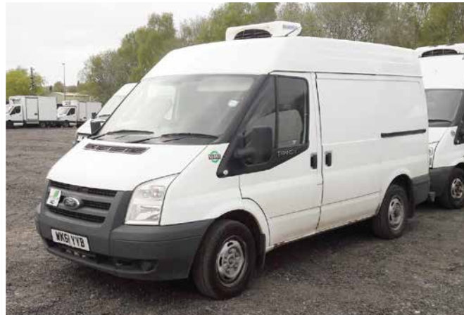
2011 FORD TRANSIT TDCI