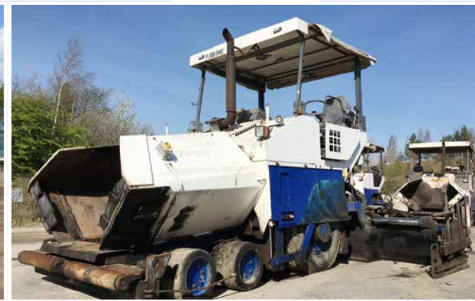
2008 VOLVO TITAN 6870