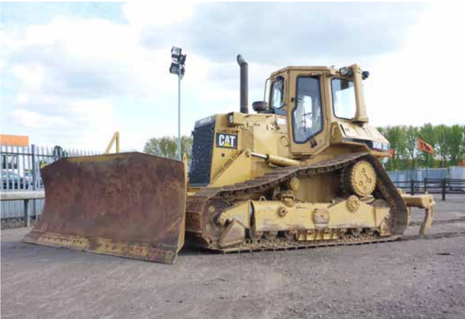
CATERPILLAR D5H XL