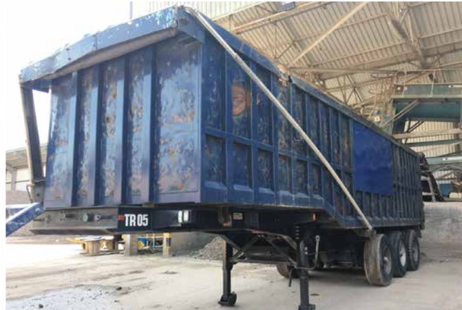
WARLEY SFT 389