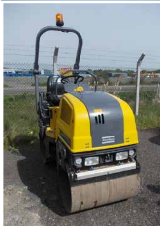
2014 DYNAPAC CC800