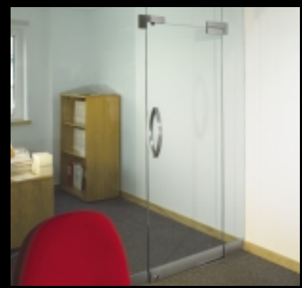
DORMA patch fittings, locks and rails allows an almost endless variety of options for the construction of toughened glass door assemblies. And for an extra touch of style, ARCOS fittings can be used.