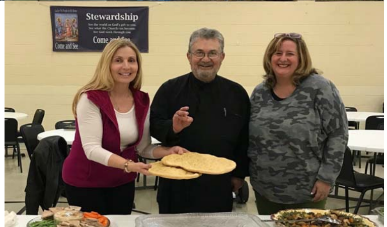
Kite Flying on Clean Monday, March 2, 2020