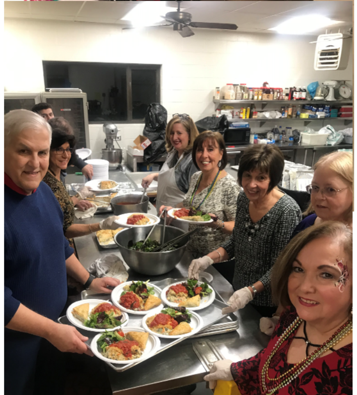
Top Row: Sunday School children sorting Food Bank donations to be delivered to the Blessed Table Food Pantry. Middle and Bottom Rows: Glendi! February 29, 2020