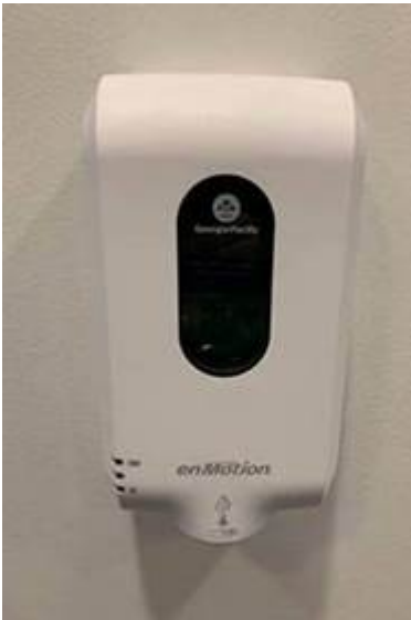
Wall Mounted Hand Sanitizer Stations in all elevator lobbies above the ground floor