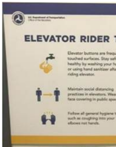
Sign at all elevator lobbies on all floors