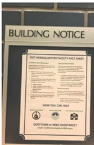
Building notice signs at elevator lobbies on all floors