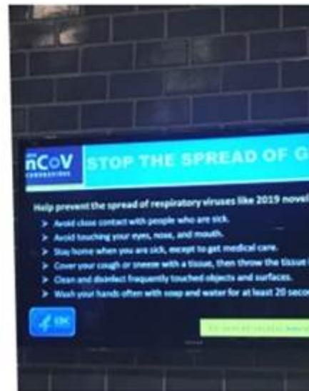
TV display on Ground Floor Elevator entrances