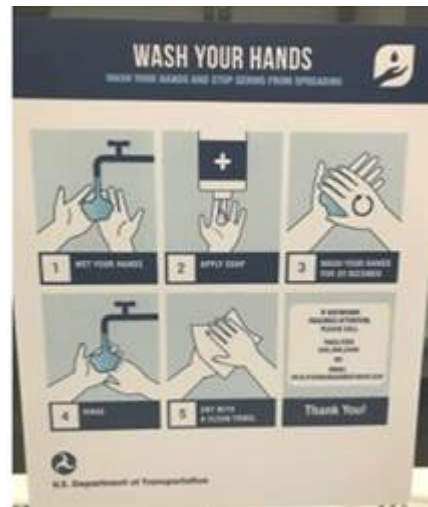
Sign in restroom and pantry sinks on all floors