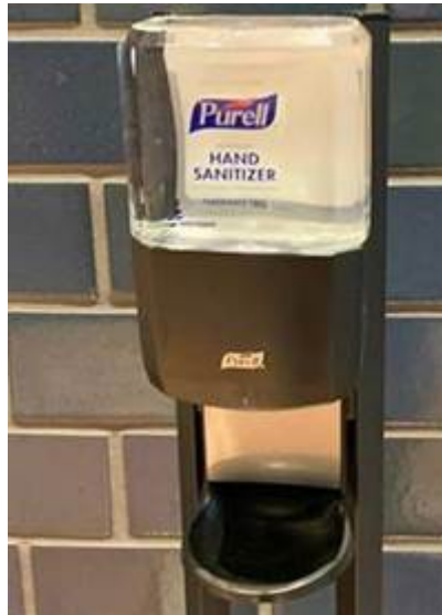
Freestanding Stations in the Shuttle Elevators and Ground Floor Elevator lobbies