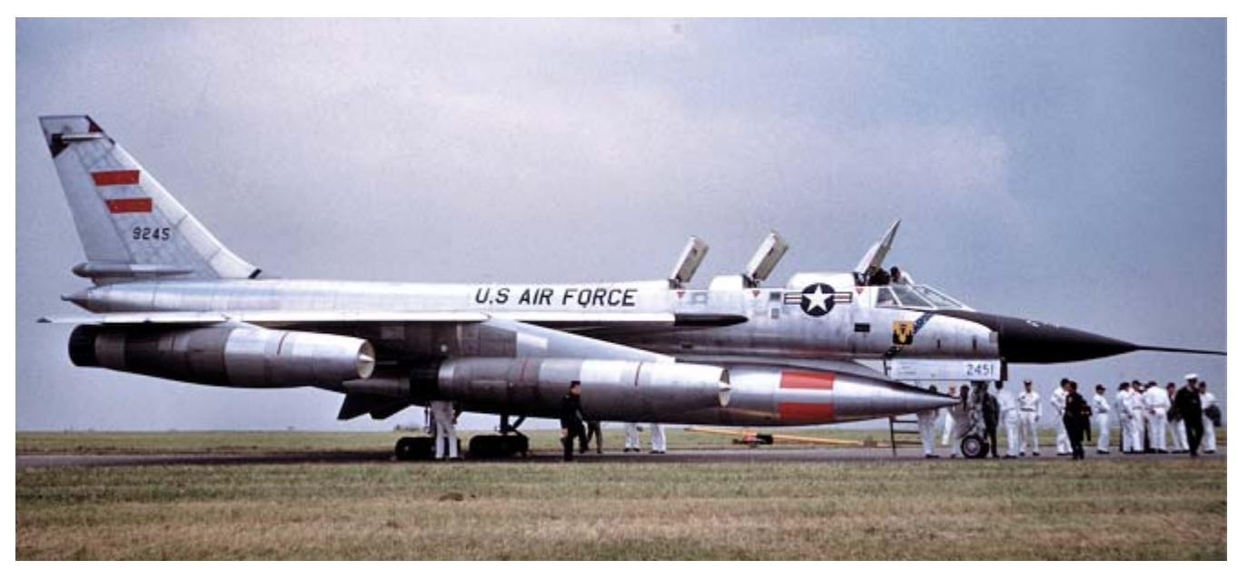
A B-58 Hustler undergoing center-line pod testing during the 1960s.