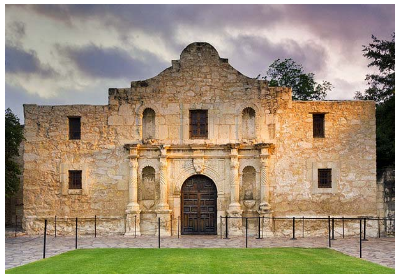
The Alamo in San Antonio.