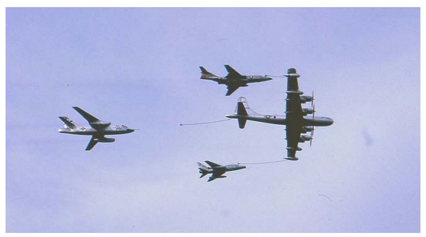
A McDonnell F-101A Voodoo, a Douglas B-66 Destroyer, and a North American F-100 Super Sabre refuel from a KB-50J tanker of the 420th Air Refueling Squadron at an RAF open day in England in 1963.