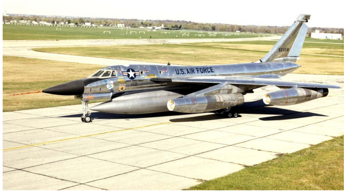
B-58A Hustler on the taxiway in Area B at Wright-Patterson AFB at Dayton, Ohio. Also see the Historian's Report on Page 3.