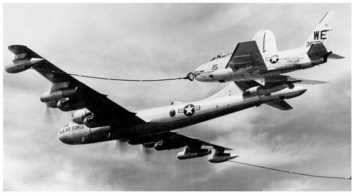
A KB-50J tanker refuels a U.S. Marine Corps FJ-4B Fury from VMA214.

and looking at that mode (one or two blips on the screen) we could identify the plane that we were supposed to refuel and guide it in. The IFF scope had range and direction markers on it. The navigator's job was done as soon as the plane saw us and the hose operators saw the plane and were in radio contact with him.