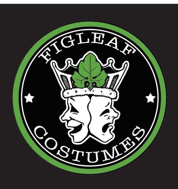
FIG LEAF COSTUMES