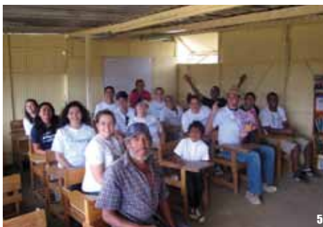
(1) Pictured above are the ten students who participated in the Alternative Spring Break. (2) Berks students are pictured with the community members and children served by the school. (3) Students completed several projects including building walls for the school. (4) Students also helped with moving furniture and desks into the newly constructed classroom. (5) The students, community members, and teachers are shown in the new classroom.