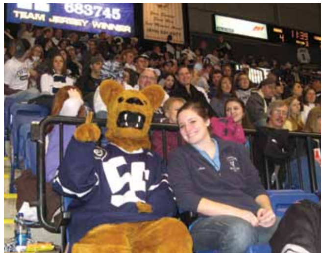
The Berks County Chapter of the PSAA held a Reading Royals Night, which raised more than $11,000 for THON.