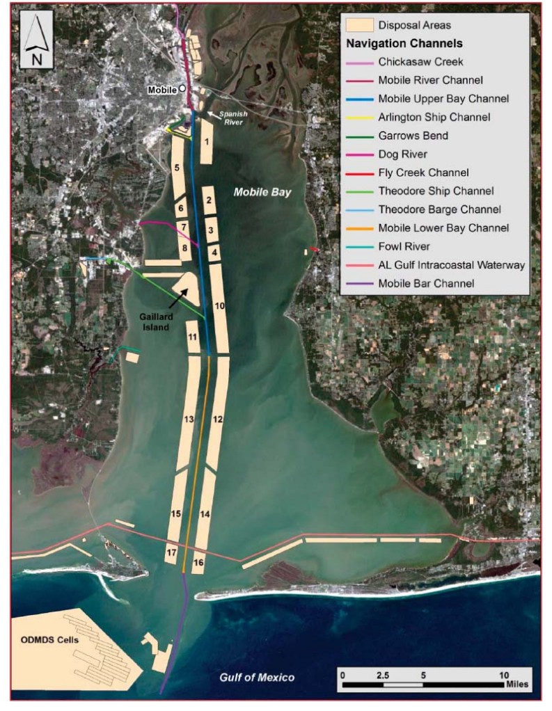
Figure 2. Locations of the pre-established open water disposal areas in Mobile Bay

A strategic placement plan provides an approach that optimizes the use of adjacent thin-layer open water sites, takes advantage of additional beneficial use opportunities, and continues the use