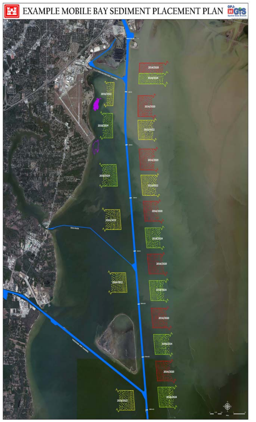
Figure 3. Example of the Strategic Sediment Placement Plan utilizing pre-established open bay placement areas

discussed previously, using such a strategy provides an environmentally acceptable alternative for managing maintenance dredged material within the Bay channel that will allow sufficient time for benthic recovery and permit the bottom elevations to return to that of the adjacent bottom as the placed sediment becomes remobilized into the Bay's natural sediment transport system.