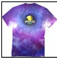
2014 Space Shirt