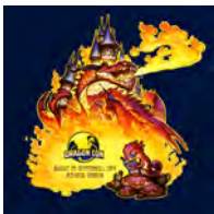
2014 Event Shirt