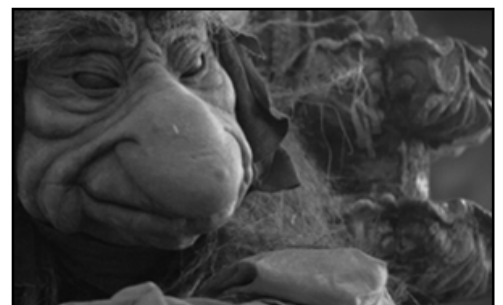
Best Animated Film: "Lesson Learned"