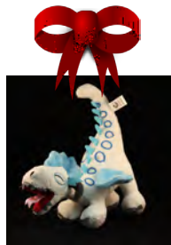
2014 Plush Dragon

Now through Saturday, December 21 all US shipping in the Dragon Con Store is only $2.00. It's a perfect time to pick up gifts and stocking stuffers like tees, hats, stickers, luggage tags, shot glasses, flasks, tumblers, tote bags, plush baby dragons, and more.