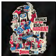
2014 Superfan Shirt