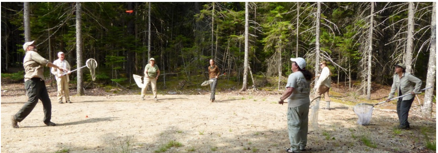
Net technique training at Eagle Hill