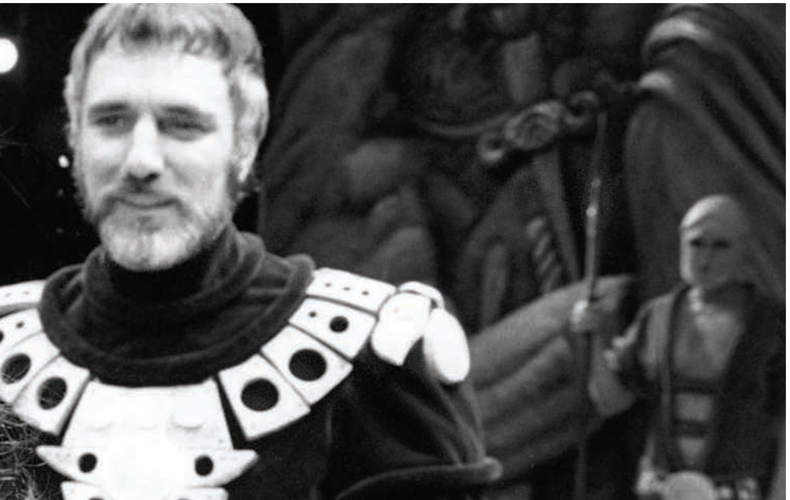
Martha Henry as Antigone and Philip Bosco as Creon in the Lincoln Center Repertory 1971 production

Roots and Affixes An affix at the end of a word is a suffix . The suffix -ly can form either an adjective (modifying a noun) or an adverb (modifying a verb, adjective, or other adverb). Find both uses of -ly in lines 121–127.