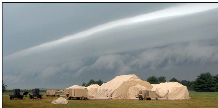
A tactical operation center setup by the Indiana National Guard's 38th Sustainment Brigade at Grissom can be seen here July 20. The guard unit from Kokomo, Ind., set up their TOC at Grissom because of the facilities and land available on base.