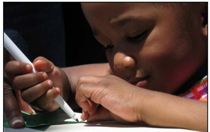
Above, this young artist got close to her work as she decorated a star during the annual Family Appreciation Day.