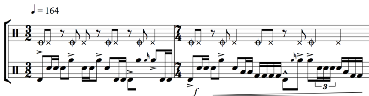
EXAMPLE 6: Mvmt. III, mm. 97-98

Incinerate also includes some instances where the speed of rhythm written and/or the order of drums and cymbals called for by Mackey may make it close to impossible for the performer to execute at the indicated dynamic and with the energy required to achieve an appropriate level of “rock star.” This “rock star” aesthetic that I am attempting to maintain and further convey with these adjustments comes from comments Mackey has made on his website regarding his intention with this last movement of the work.