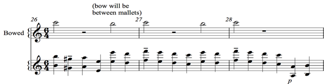
EXAMPLE 4: Mvmt. II, mm. 26-28

the bow in their right hand prepared to drop down between the two mallets. Because of this position, and the fact that the performer is asked to attack the bars at the very top of the instrument's range, the body center should be extremely high behind the vibraphone, with the hips turned towards the center. It is also highly recommended that the player take Mackey's suggestion to depress the pedal with a weight since it is held down throughout, which would make this passage much more comfortable.