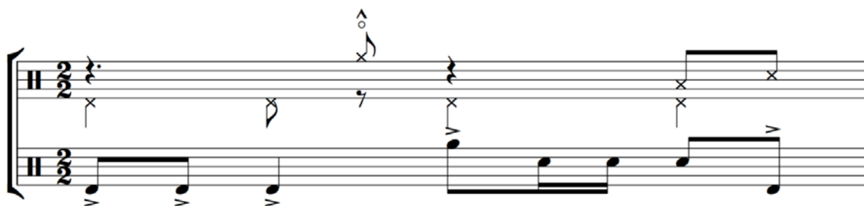
EXAMPLE 8: Mvmt. III, revised m. 53

The end of the percussion break in the middle of the movement is one of the most challenging passages for the soloist in the entire concerto. At the end of measure 101, shown in Example 9, there is one small adjustment that can be made to assist in the execution and clarity of this important fill. On beat six (counting in 6/4 rather than 3/2), the line requires the soloist to play descending sixteenth notes, and then immediately jump back up to the top tom on the first beat of measure 102. With almost any setup possible, these rhythms would have to be played with a right-hand lead approach, which would create an awkward sticking moving back up the drums at this tempo and volume. By omitting the “e” of beat six, as seen in Example 10, the soloist can get their left hand down to the low tom, alternate the three sixteenth notes, and have a much smoother transition back up to the top tom in measure 102.