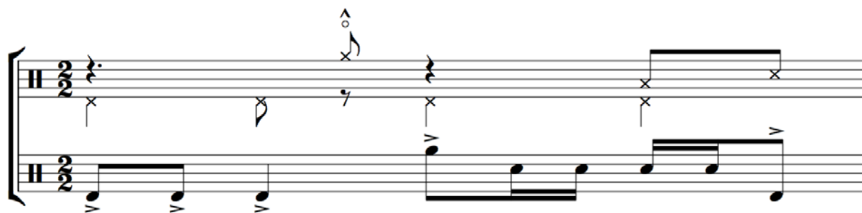
EXAMPLE 7: Mvmt. III, original m. 53