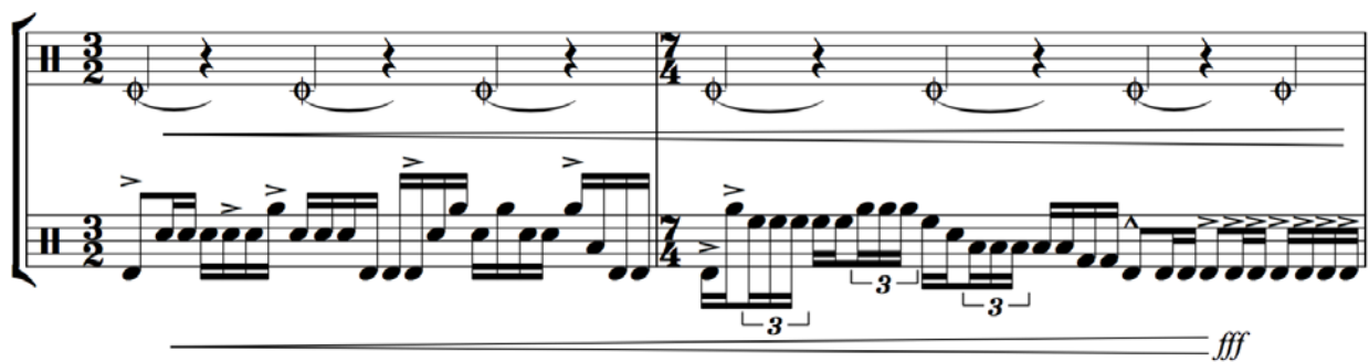
EXAMPLE 9: Mvmt. III, original m. 101-102