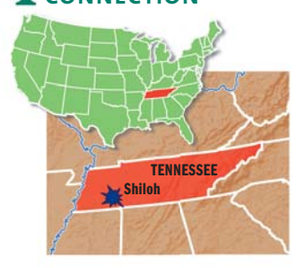
The Battle of Shiloh took place near Shiloh Church, on the banks of Owl Creek.