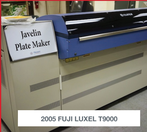
2005 FUJI LUXEL T9000