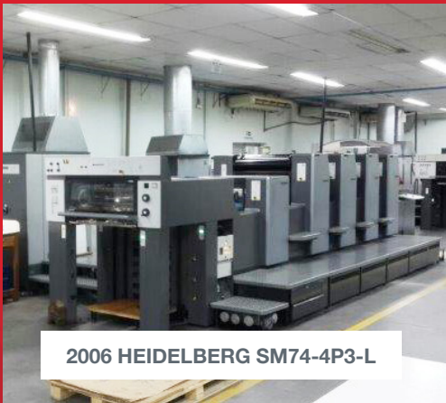
2006 HEIDELBERG SM74-4P3-L