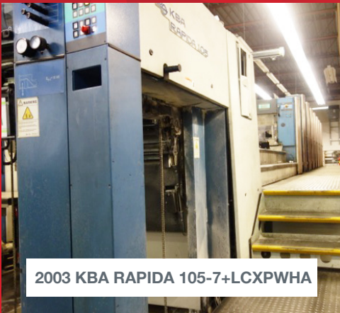
2003 KBA RAPIDA 105-7+LCXPWHA