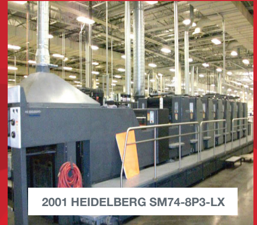
2001 HEIDELBERG SM74-8P3-LX