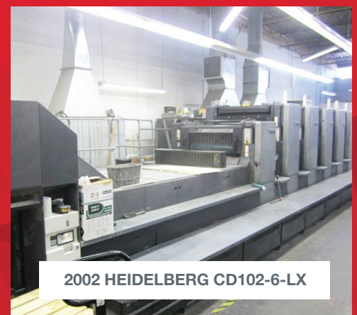
2002 HEIDELBERG CD102-6-LX