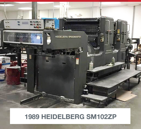
1989 HEIDELBERG SM102ZP