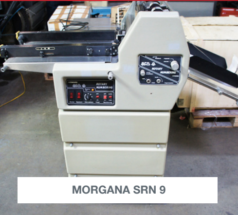
MORGANA SRN 9