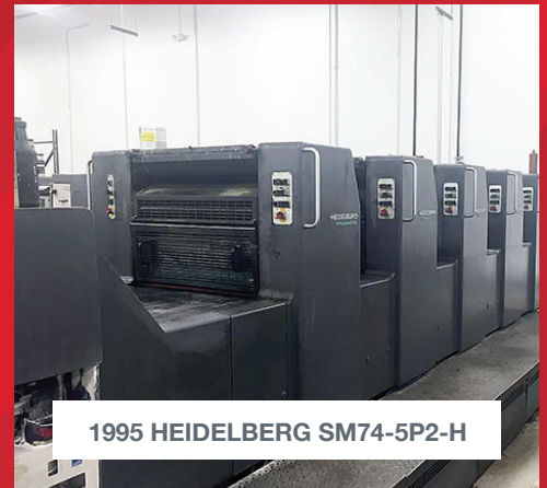
1995 HEIDELBERG SM74-5P2-H