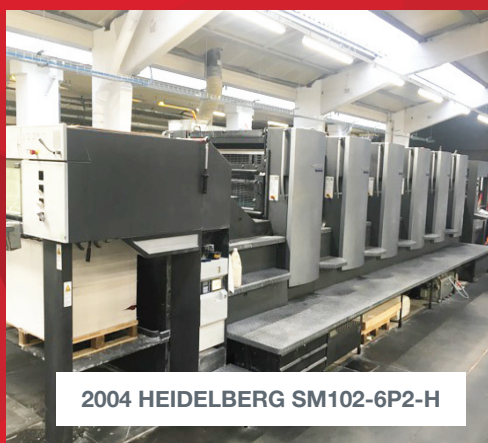
2004 HEIDELBERG SM102-6P2-H