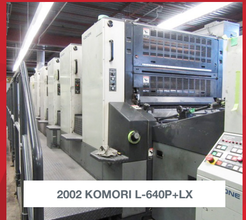
2002 KOMORI L-640P+LX