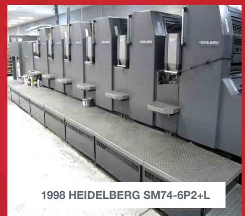
1998 HEIDELBERG SM74-6P2+L