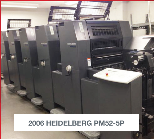
2006 HEIDELBERG PM52-5P