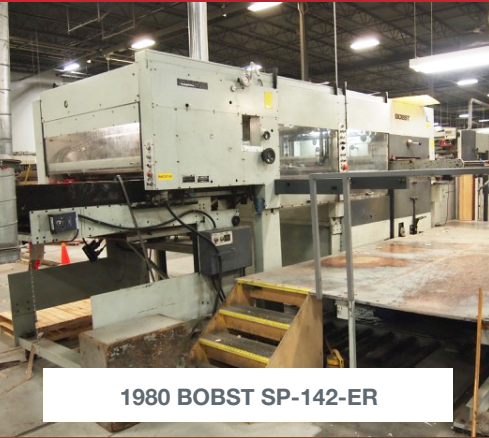
1980 BOBST SP-142-ER