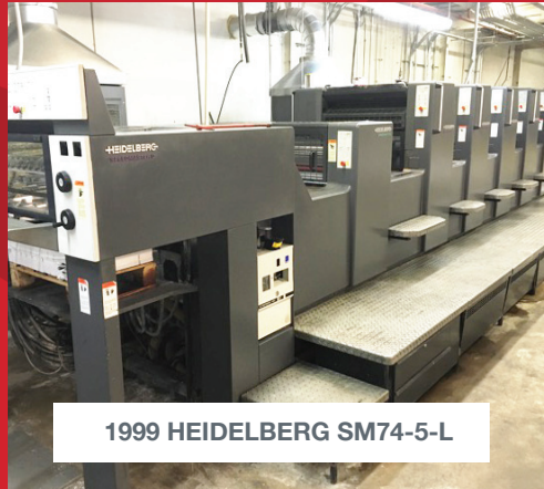
1999 HEIDELBERG SM74-5-L