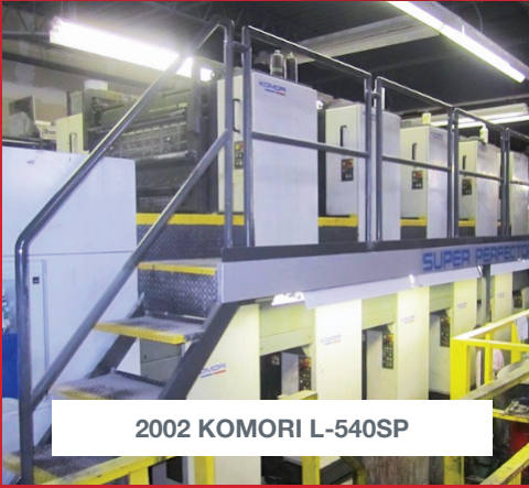
2002 KOMORI L-540SP