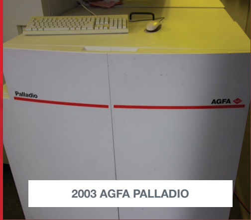
2003 AGFA PALLADIO