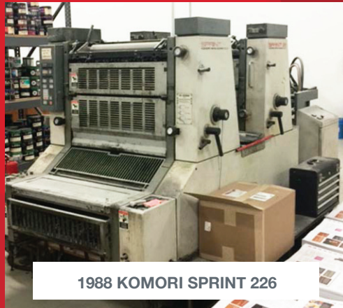
1988 KOMORI SPRINT 226