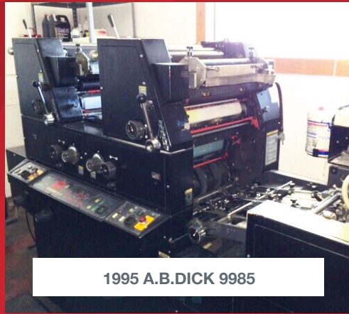
1995 A.B.DICK 9985