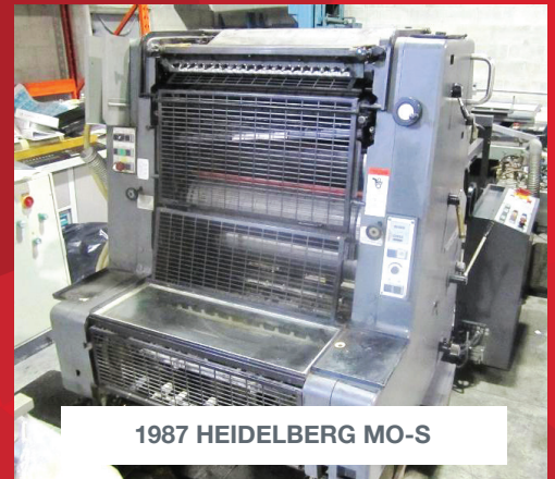
1987 HEIDELBERG MO-S