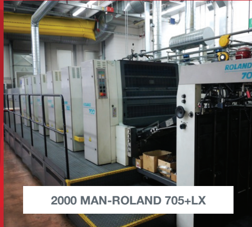
2000 MAN-ROLAND 705+LX