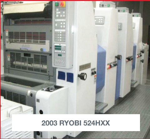
2003 RYOBI 524HXX