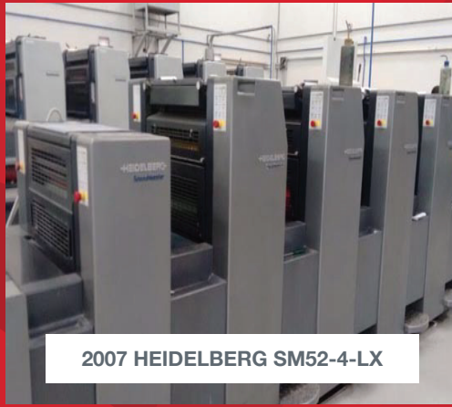
2007 HEIDELBERG SM52-4-LX