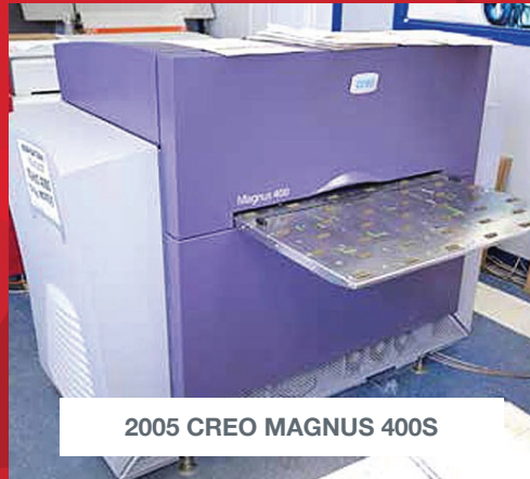
2005 CREO MAGNUS 400S