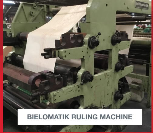
BIELMATIK RULING MACHINE