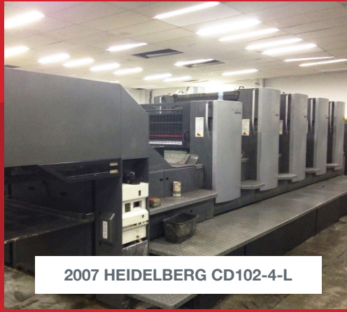
2007 HEIDELBERG CD102-4-L