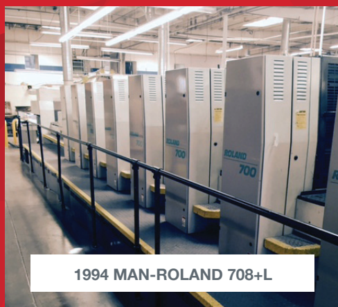
1994 MAN-ROLAND 708+L