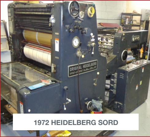
1972 HEIDELBERG SORD