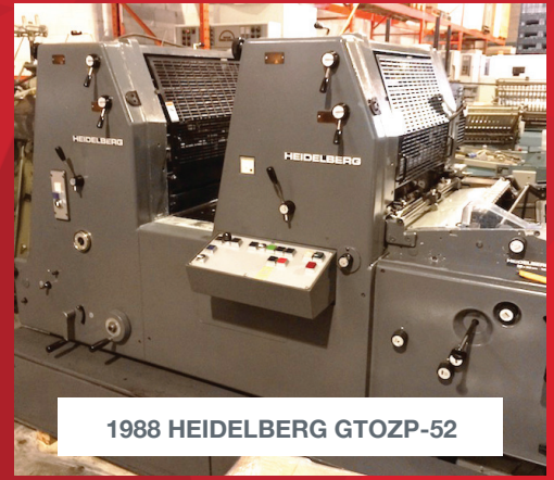
1988 HEIDELBERG GTOZP-52