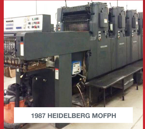
1987 HEIDELBERG MOPFH