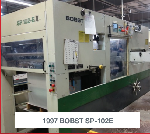
1997 BOBST SP-102E