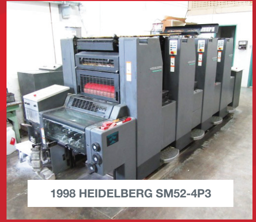
1998 HEIDELBERG SM52-4P3