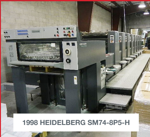
1998 HEIDELBERG SM74-8P5-H