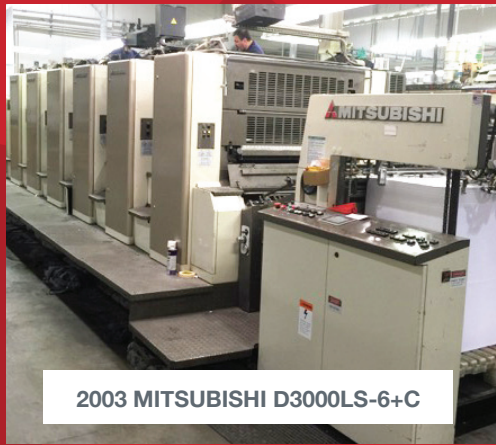
2003 MITSUBISHI D3000LS-6+C