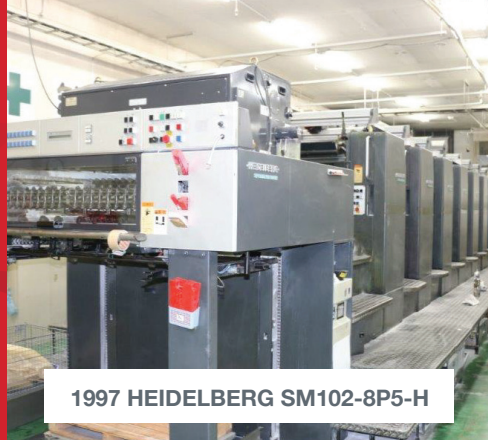
1997 HEIDELBERG SM102-8P5-H