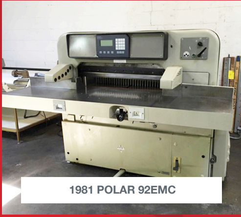
1981 POLAR 92EMC