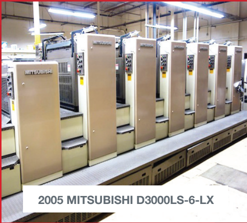
2005 MITSUBISHI D3000LS-6-LX