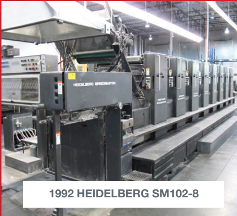
1992 HEIDELBERG SM102-8

Drupa 2016 Hall 13, Stand 13G72 & Hall 16, Stand 16A29