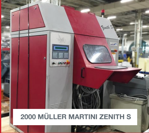
2000 MÜLLER MARTINI ZENITH S