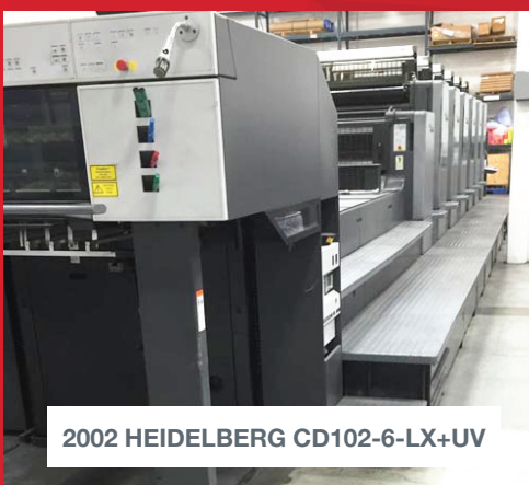
2002 HEIDELBERG CD102-6-LX+UV