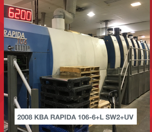
2008 KBA RAPIDA 106-6+L SW2+UV