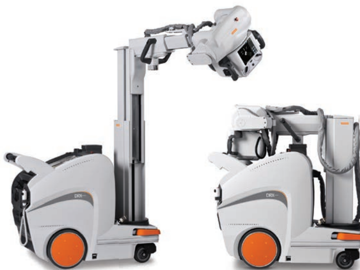
The DRX-Revolution's collapsible column makes it easy to navigate.

For accelerated productivity and elevated patient care, join the revolution. The DRX-Revolution.