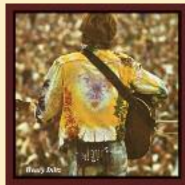
John Sebastian on stage at Woodstock – August 1969.

"When I first heard Martin's new CEO-6, I called Martin to ask where'd they'd been all my life. Being a longtime fan of the slope shouldered Dreadnoughts, I asked if I could get one with a bluesier 12" radius fingerboard and maybe some gorgeous flamed koa for the back and sides for a little more upper end touch. Martin's instrument has become my primary acoustic. Just play an E chord and your socks will roll up and down. Ahh!"