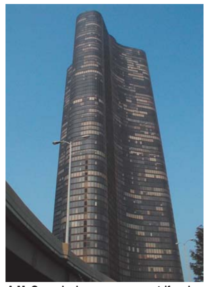
A McQuay dual compressor centrifugal chiller provides quiet operation and energy cost savings for Harbor Point Condominiums in Chicago.