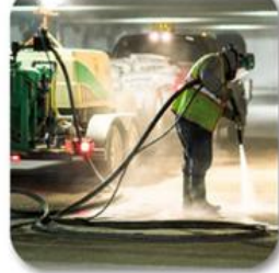
Line Stripe Removal