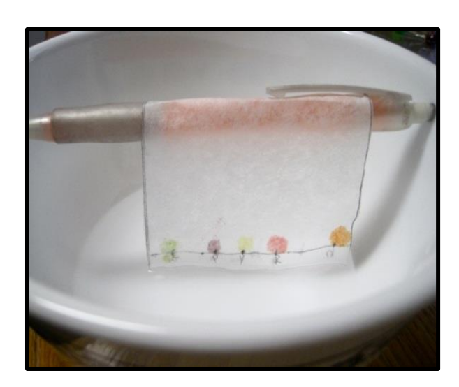
Figure 5: M&M and Skittles Experiment Setup

Now that you have completed the experiment, you are ready to interpret your results.