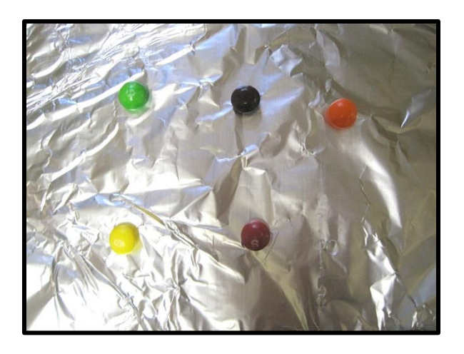
Figure 2: Skittles Soaking in Water Droplets

After completing the steps above, you are ready to place the candy dyes on the coffee filter paper.