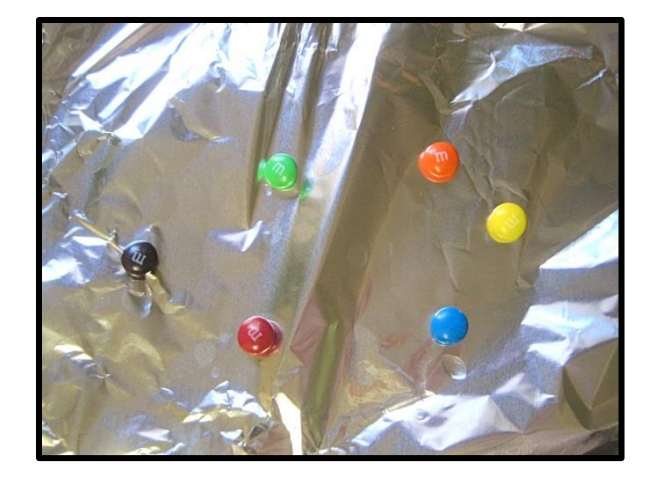
Figure 1: M&M Soaking in Water Droplets