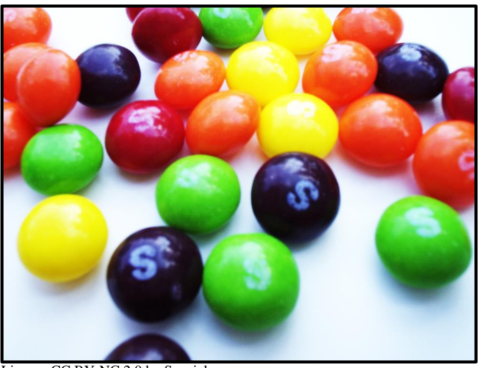
License CC BY-NC 2.0 by Special