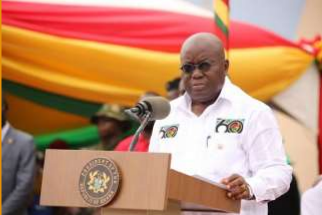
His Excellency Nana Addo Dankwa Akufo-Addo , President of Ghana

Fighting corruption has been one of the major focus of His Excellency Nana Addo Dankwa Akufo-Addo although the President has been in government for just one year.