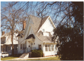
The Larned A. Waterman Iowa Nonprofit Resource Center 130 Grand Avenue Court Iowa City, Iowa 52242 Toll free: 1.866.500.8980

All newsletter content is provided for informational purposes only and does not constitute legal counsel. Although we have made every attempt to ensure accuracy, the INRC is not responsible for any errors or omissions or for the results obtained from the use of this information. All information is provided with no warranty of any kind.