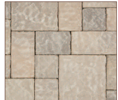
THREE TONE BROWN

NOTE: Not all colors are available in all products.