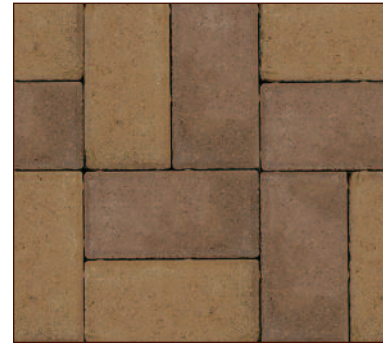
TWO TONE BROWN