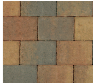
OLD TOWN BLEND