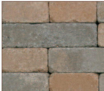
TAN / DARK BROWN RUMBLED ™ WALL