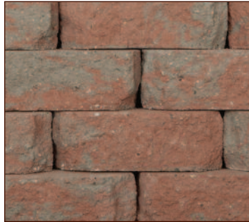
✓ OAKS BLEND