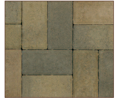
TAN / DARK BROWN