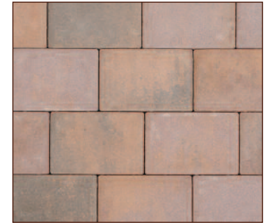
HONEY SUCKLE BLEND