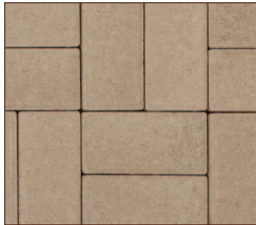
LIGHT CREAMY TAN