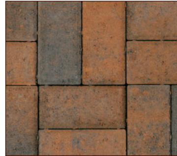
ANTIQUÉ TERRA COTTA