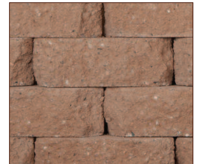
✓ TERRA COTTA