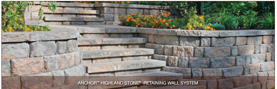
ANCHOR ™ HIGHLAND STONE ® RETAINING WALL SYSTEM

NOTE: Not all colors are available in all products. ✓These colors are subject to an upcharge.