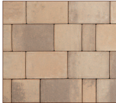
THREE TONE BROWN