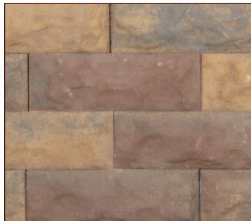
SIERRA BLEND ARAZZO ™