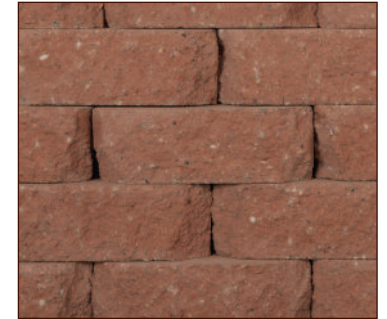
✓ RIVER RED