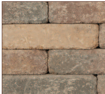
SIERRA BLEND RUMBLED ™ WALL