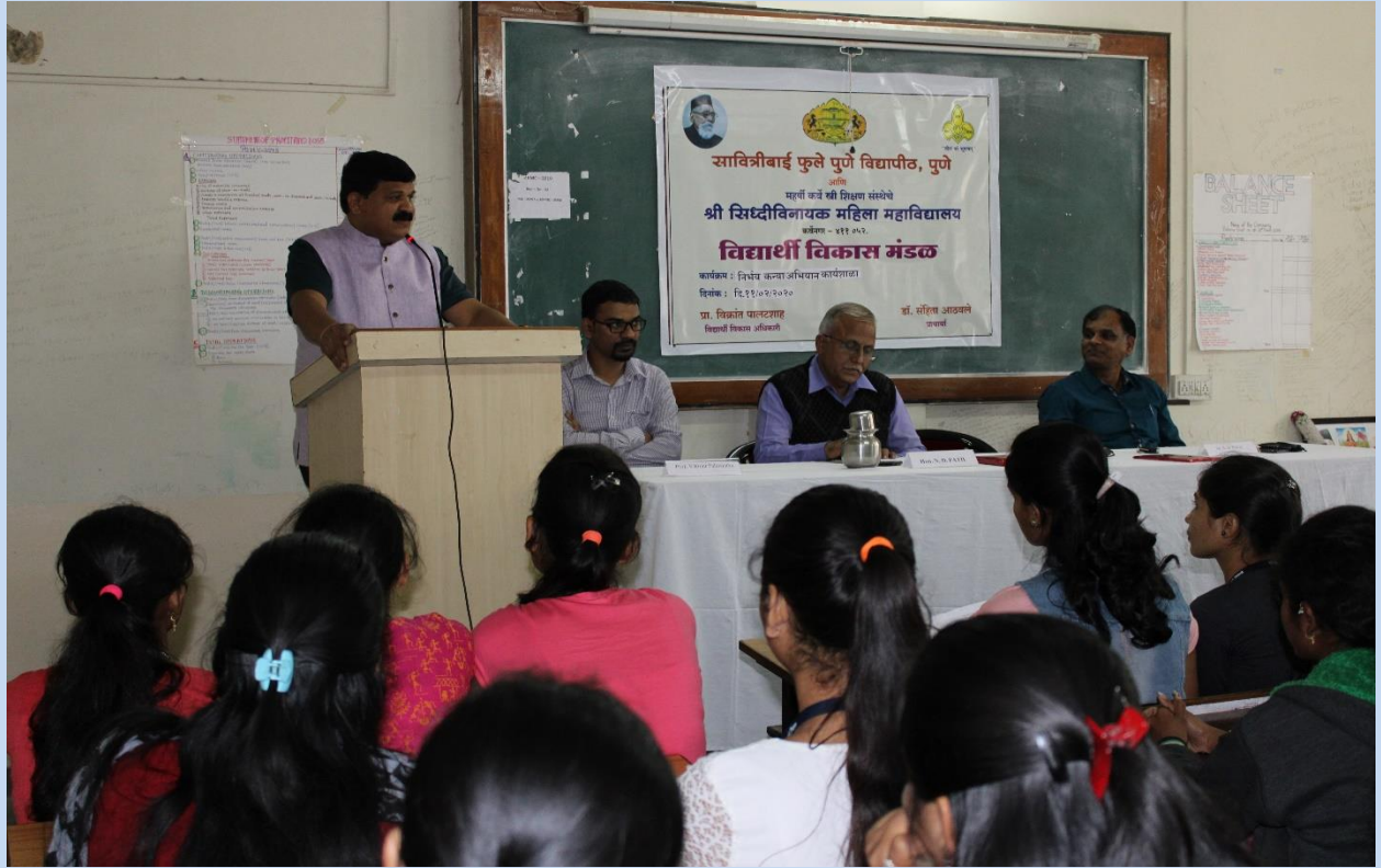
Student Development Activity