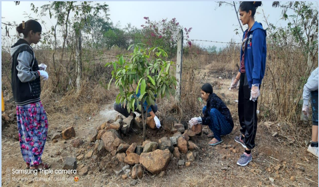
Tree Protection by NSS Volunteers in Camp on 09/01/2020