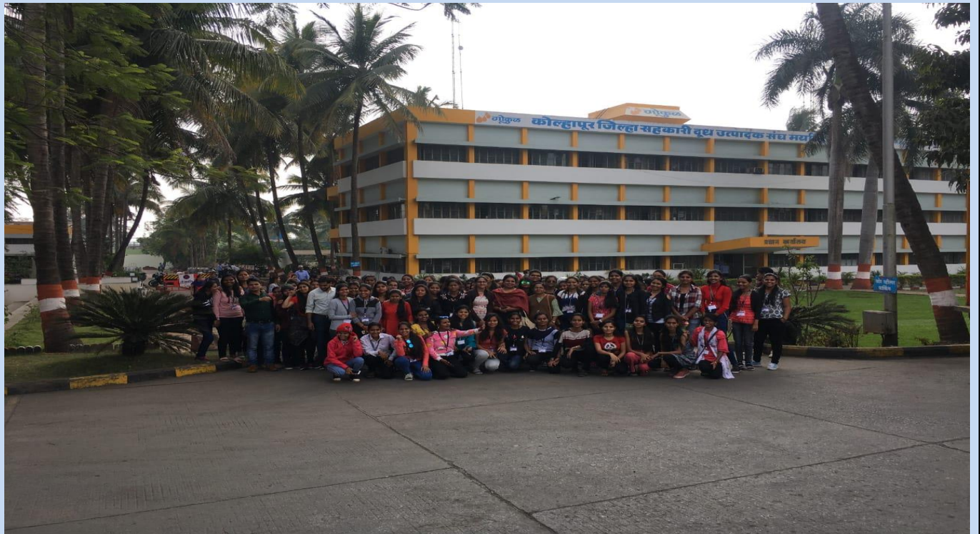
Visit to Gokul Dairy