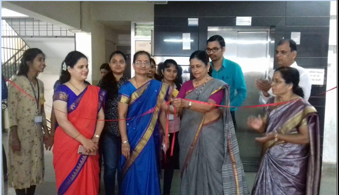
Inauguration of Udyogini Divas.