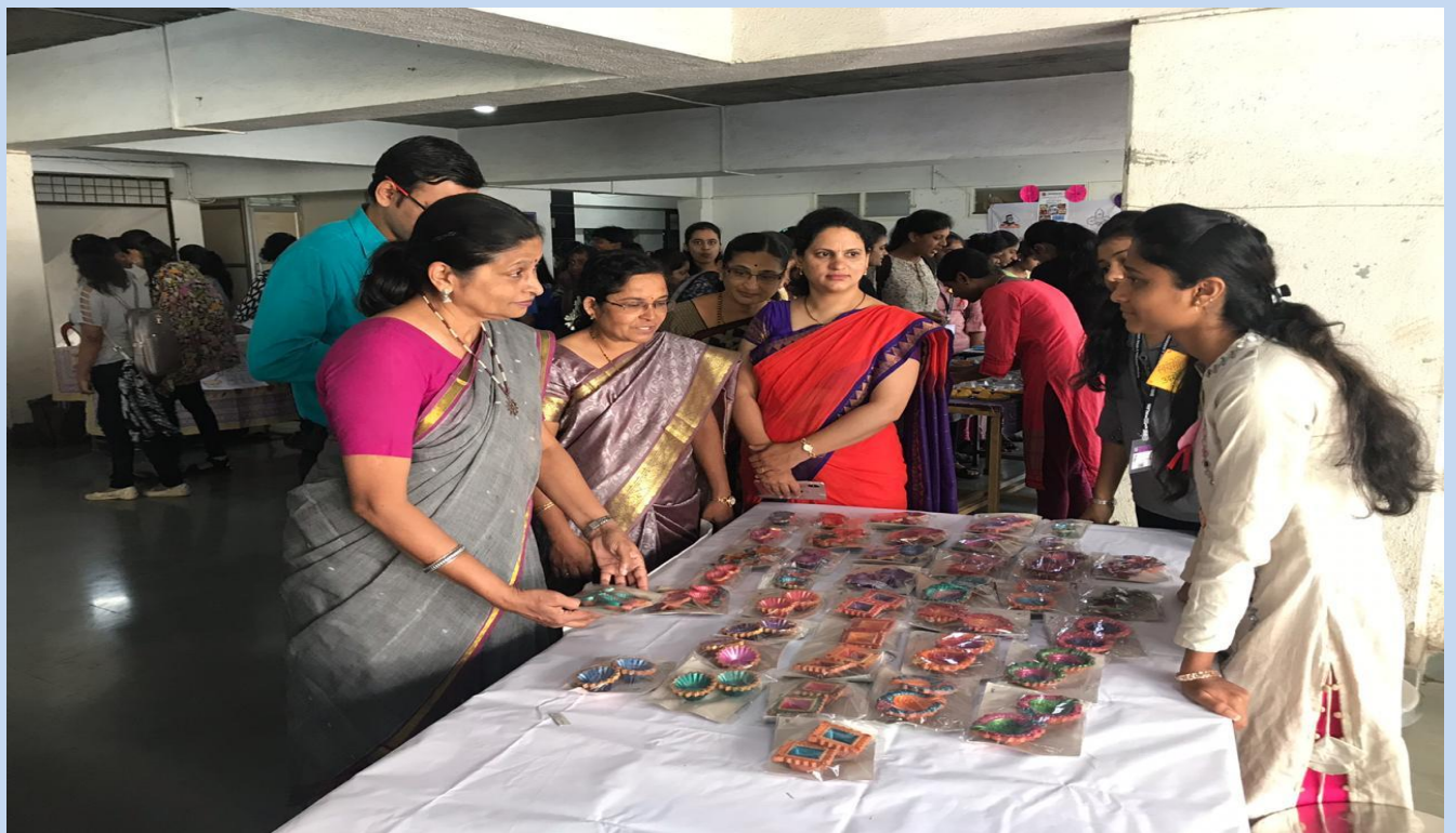
Celebration of Udyogini Divas