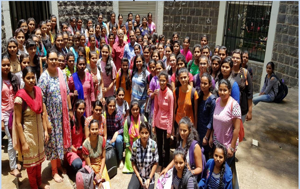
Induction Programme 2019-20