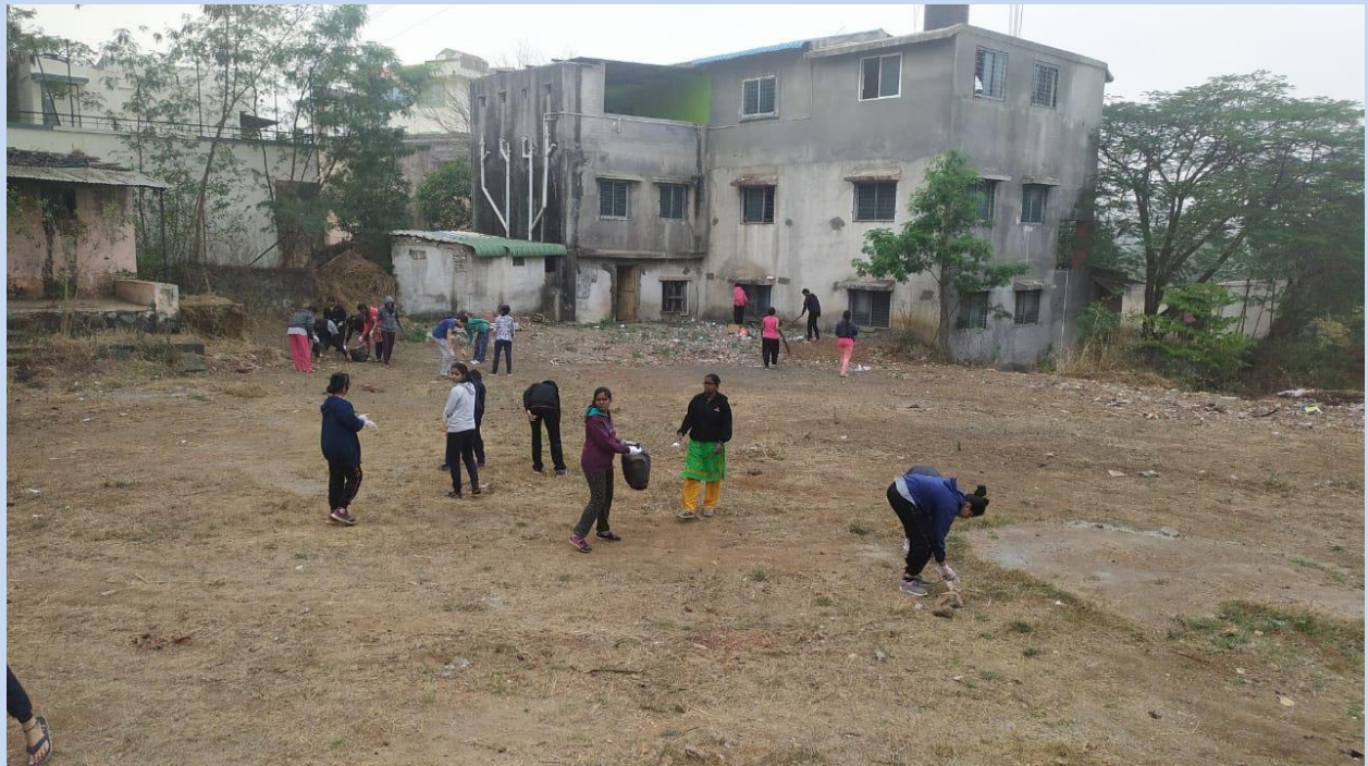
Cleanliness Drive by NSS Volunteers in Camp on 10/01/2020