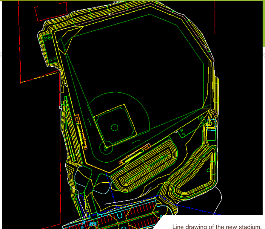
Line drawing of the new stadium.