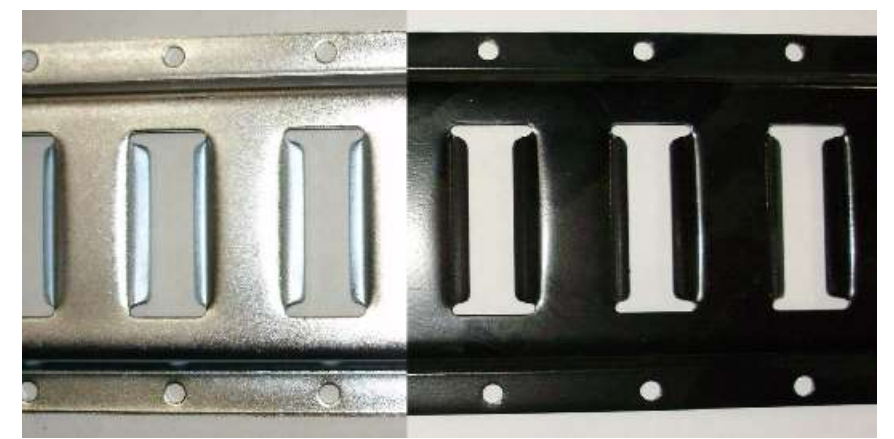
Horizontal E track; galvanized vs. painted

E Track Car Hauler Guide Summer, 2018 Page: 1 of 15