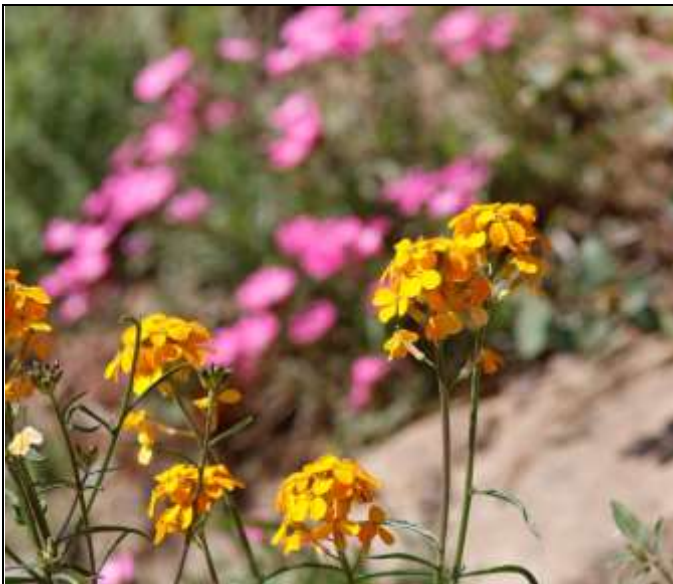
Post Rough Fire wildflowers were spectacular.

Sequoia ForestKeeper staff visited the post-fire area during a Forest and Park Service open house in June 2016, although the dog and pony show opened little of the fire area for the public to actually see 2 . It was disheartening to be left in the dark as to how the many burned giant sequoia groves fared during the fire and especially after the Forest Service's firefighting efforts. Many bulldozers through sensitive habitat may have been necessary in the heat of the firefight, but true efforts at ecological restoration detailed in the Burned Area Emergency Response (BAER) team report must be open and above board in order to trust Forest Service managers. Our government and its employees must be honest with the public, so that dialog and cooperation are achieved in returning the ecological balance that benefits nature not just consumptive users that hold political favor.