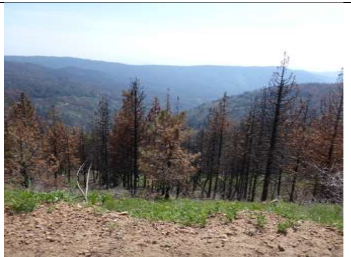
Post Rough Fire overstocked, even-aged plantations were severely burned. Mixed age forest fared much better.

SFK visited the area along Hwy 180 all the way to Cedar Grove in the Park and conducted surveys of the burned trees and the post-fire wildflower bloom. We were not able to see the burn in the Giant Sequoia National Monument sequoia groves except the Converse Basin Grove. There were areas along the highway, especially in plantations, which burned very hot, killing all of the densely spaced young trees. The wildflower bloom was spectacular, and our staff documented 97 species of plants and animals in the limited, publicly-open area along