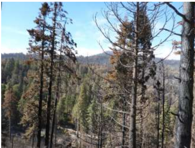
The view from Black Mountain Saddle on the Greenhorn Mountains demonstrates the mosaic burn of the Cedar Fire. There are many areas where overstocked, dead plantations burned completely.

Crown fire areas, where many trees burn completely, are occupied by wildlife soon after the flames die down. Within a month, ferns, shrubs, and oaks will sprout from their roots. After the spring rains, many plant families flourish in post-fire areas creating carpets of spectacular color. Closed cone pines and sequoia cones open with heat and litter the newly exposed mineral soil with millions of seeds. The new forest will thrive as long as subsequent fires are not too frequent.