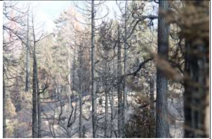
Tiger Flat along Forest Highway 90, pre and post fire.

Public access to the Cedar Fire area has not been a problem. Hunters and motorcyclists pushed to reopen the area before the fire was extinguished. SFK staff was able to inspect the fire area along accessible roadways numerous times in October and November until the gate closed for winter. We found trees that had died prior to the fire, especially in plantations, that burned very hot with some plantations completely blackened. Areas where the forest was a mosaic of large and small diameter trees and shrubs, fared much better with more of an understory burn. The fire burned most intensely through the 1990 Stormy Complex Fire restoration area, reducing many of the plantations to charcoal sticks. Areas that had not been logged or burned in recent history had mixed intensity burn. Areas where water extractions were numerous, appeared to suffer more significant crown fire, while areas with no obvious water diversions fared better. Panorama Campground along Forest Highway 90 survived with minimal scorching. We did not examine the western slope vacation communities.