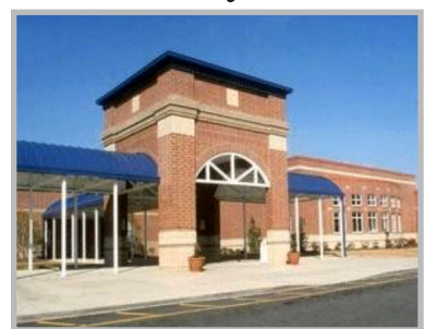
Mount Airy Middle School