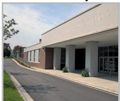
Mount Airy High School