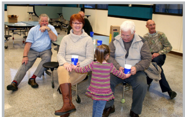
Sweet Door Prize Helper