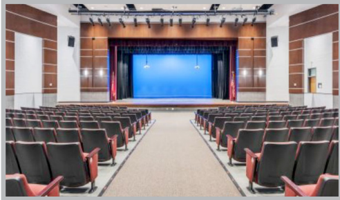
Spring Creek Middle