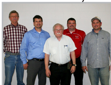
New officers l-r