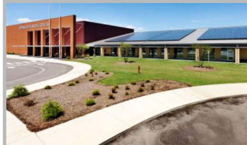
Spring Creek Middle