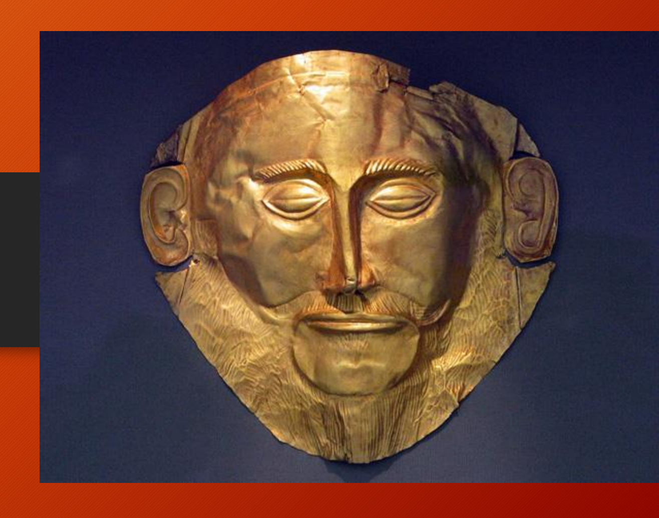
Mask of Agamemnon