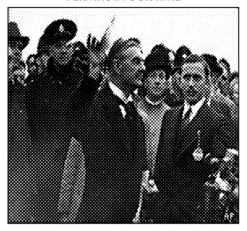
BUSINESS COMMUNITY APPEASED AS WORK PERMIT LAWS RELAXED

EMPLOYERS HAVE 'NO FURTHER DEMANDS' SAYS BELL