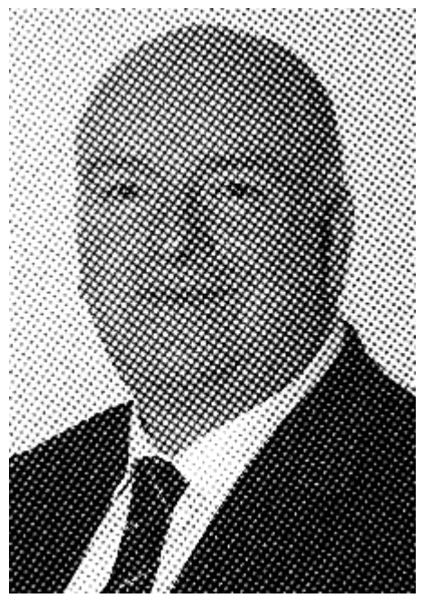
Howard Quayle MHK. Chief Minister

permit regulation to let employers practice cronyism and anti-Manx discrimination on an official basis.