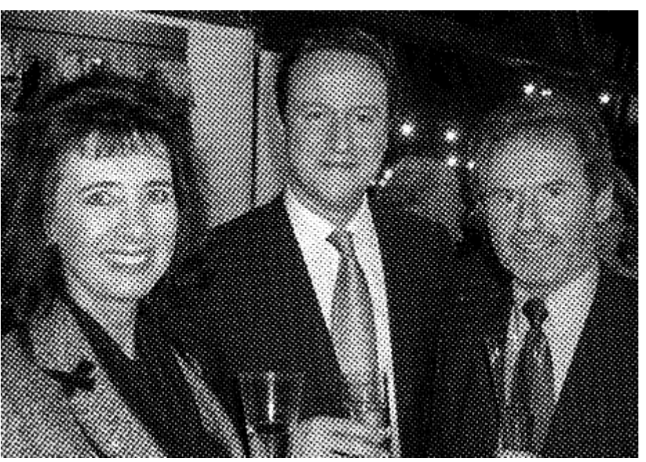
Former English Conservative village councillor and now Isle of Man minister for fisheries, Baron Boot, pictured with someone else.

http://mecvannin.im/archive/territorial waters.html