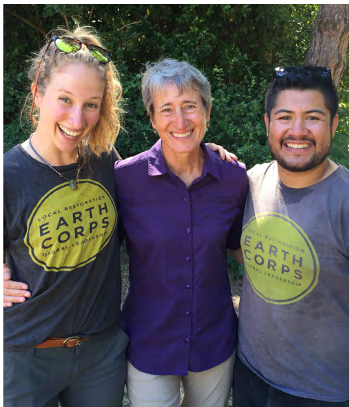
Secretary of the Interior Sally Jewell at the Let's Move Outside launch at Seward Park in August 2016