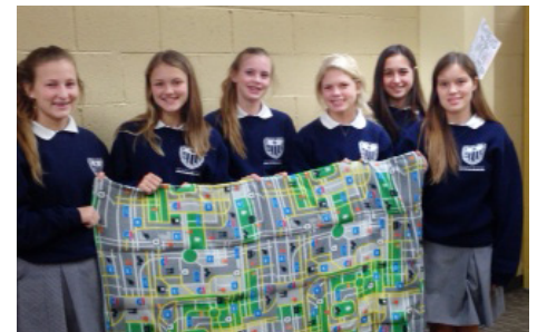
Volunteers from Mount St. Mary's made weighted blankets