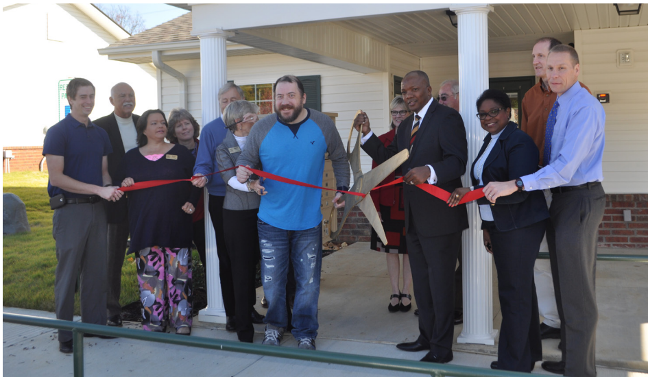
Ribbon cutting at Harold Court Apartments