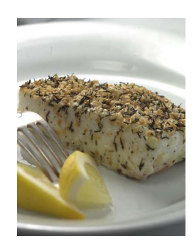
Thyme- & Sesame-Crusted Halibut