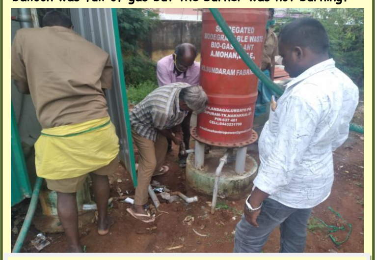
Inspection is on as per protocol ....

Our supervisor checked every aspect as per the inspection protocol starting from inlet, outlet, gas holder, pipeline etc. Surprisingly everything was ok. The balloon was full of gas but the burner was not burning.