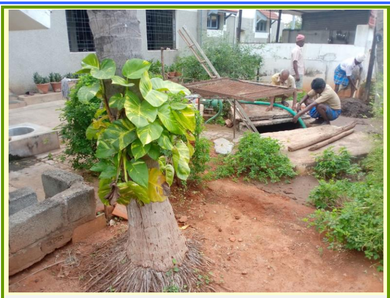
Neat and clean surroundings near the plant. Pumping out of slurry is on ...

With the help of slurry pump, they removed all the slurry from the plant. Then our supervisor requested the labourers to enter inside the plant through inlet as there was lot of scum and mud accumulated inside. Labourers were afraid to enter and so Shri.Muneeswaran himself went inside first and started cleaning the dirt accumulated inside the plant. Afterwards, other workers joined him and removed lot of scum as well as sand and soil deposited in the plant. After cleaning with water, the house owner again started feeding the plant with fresh cow dung slurry.