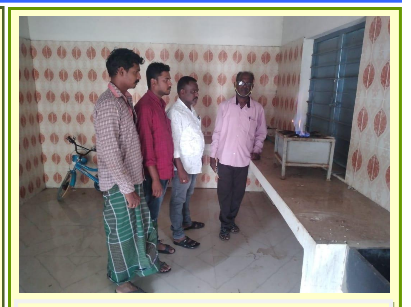
At last a blue flame appeared...

Our supervisor intuitively understood that there must be water in the pipeline. His guess was correct. He drained all the water and fitted one extra valve for draining the water in future. After removing the water, he was sure that the burner would start burning. However, to his disappointment, there was no flame coming.