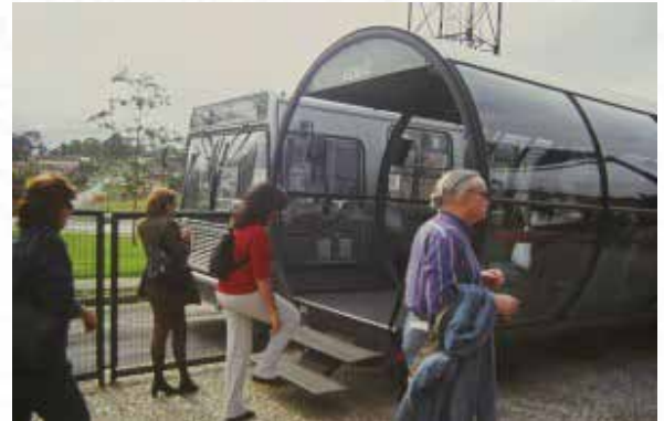
Ecocity transit: Curitiba's Bus Rapid Transit (BRT) is one of the most heavily used, but low-cost, transit systems in the world.

Curitiba, Brazil for its sustainable layout, design and many particular interrelated features: pedestrian centers, plazas and streets, density paired with transit around streets dedicated to buses; slum replacement with mixed use shops; flood control money removing dangerous housing to create parks that flood harmlessly temporarily, etc.