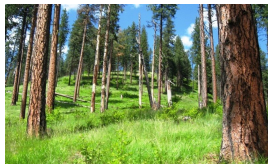
Reference Plant Community

Time. Low severity ground fires every 10-20 years to create patchy open grown ponderosa pine and Douglas-fir with grass dominant