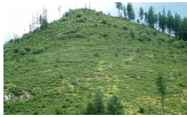
Stand (Replacement) Initiation

Stand replacement disturbance. Severe Fire or insect mortality killing large pine/fir