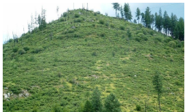
Stand (Replacement) Initiation