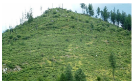
Stand (Replacement) Initiation