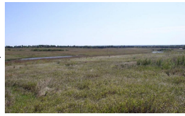
Schizachyrium scoparium - Bromus inermis , Schedonorus arundinaceus (Little bluestem-Brome, fescue)

Establishing a grazing regime that focuses pressure during the cool season grasses' active growth period while providing rest during the warm season growing season will promote a shift back to community phase 2.1. Prescribed fires used in conjunction with a cool-season grazing program will accelerate the process. In the presence of a viable native seedbank, non-selective herbicides applied in the early spring and late fall when invaders are actively growing can be beneficial. Established stands of the cool season invaders may require complete renovation through chemical treatment followed by re-seeding of the native vegetation. Once the warm-season community is re-established, ongoing prescribed grazing and fire management with adequate rest and recovery during the summer months is critical.