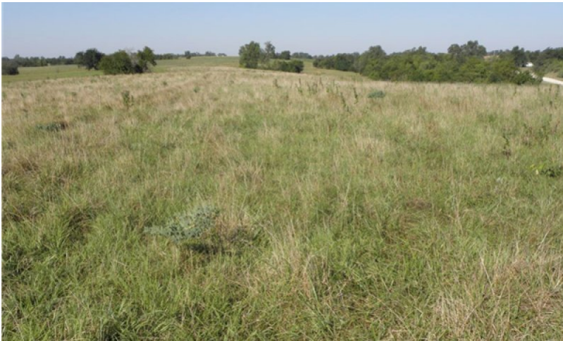
Figure 18. Tall fescue

This community is predominately smooth brome or tall fescue and may have a Kentucky bluegrass sub-component. Native warm-season grass remnants may or may not still be present. Smooth brome primarily occurs throughout the northern half of the MLRA, while tall fescue is common in the south. Vegetative production from smooth brome and tall fescue dominated communities can be highly variable depending on the species composition and external inputs such as fertilizer and weed control. In a normal year, biomass produced can range from 2,500 to 3,000 lbs./acre, with an average of 2,750 on rangelands with a dominant cool season grass component of 75 percent or more.