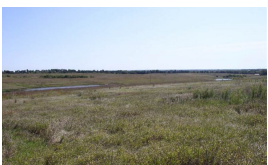
Schizachyrium scoparium - Bromus inermis , Schedonorus arundinaceus (Little bluestem- Brome, fescue)