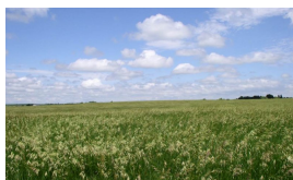
Bromus inermis , Schedonorus arundinaceus ; Smooth brome, Tall fescue)

This is a continuation of the processes and effects addressed in Transition T1A. Persisting stressors on desirable species allow for further expansion and dominance of brome and/or tall fescue. Site structure and function largely resemble a seeded pasture monoculture, although scattered natives may still be found. Introduced grass seeding,