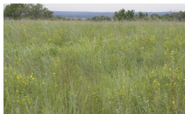
Andropogon gerardii - Sorghastrum nutans (Big bluestem-Indiangrass)

A shift from the Sideoats grama-Little bluestem community toward the Big bluestem-Indiangrass community is