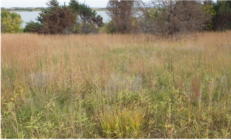
Figure 20. Pawnee Lake SRA - burn program to restore grassland