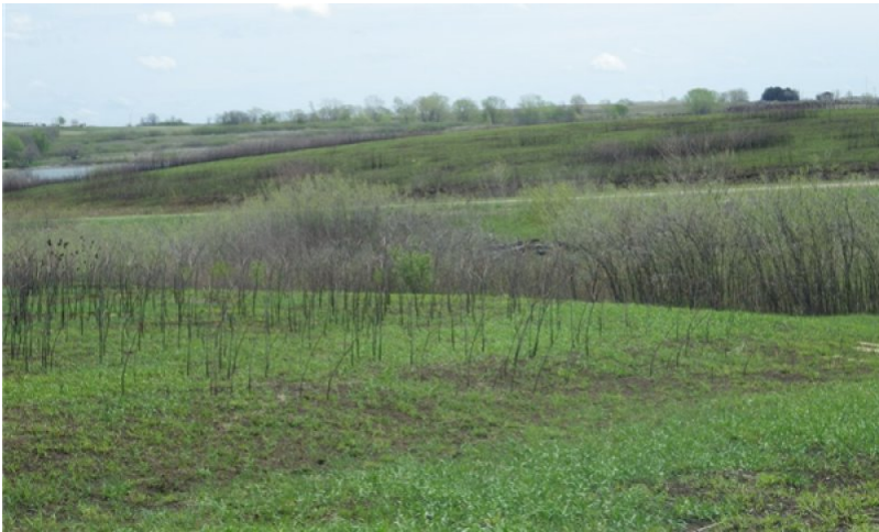
Figure 21. Shawnee State Lake - post-burn; brome understory

If ERC is the dominant tree, the canopy cover is at least 30 percent. Honey locust and smooth sumac encroachment may also be occurring when brush management and prescribed or wild fires are absent over an extended period. The grassland has converted to woodland resulting in a closed canopy that dramatically reduces the resources available for herbaceous production by intercepting rainfall and sunlight. Total annual production during an average year varies significantly, depending upon the production level prior to encroachment and the percentage of tree canopy cover.