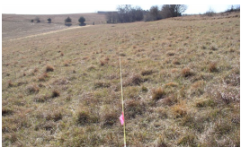
Bouteloua curtipendula - Schizachyrium scoparium (Sideoats grama-Little bluestem)