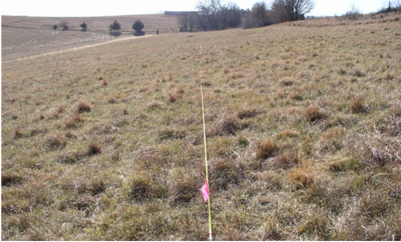
Figure 13. Midgrass dominant during drought

This community phase marks a significant reduction in warm-season tallgrasses that have decreased due to continued excessive defoliation and/or prolonged drought. Decreased plant litter reduces effective precipitation causing a decline in production compared to the Big bluestem-Indiangrass community. Reduced efficiencies in the nutrient, mineral, and hydrologic cycles further impair soil health. Total average annual production ranges from 3,300 to 4,100 pounds of air-dry lbs/ac with an average of 3,700 lbs/ac.