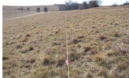
Bouteloua curtipendula - Schizachyrium scoparium (Sideoats grama-Little bluestem)

A shift from the Big bluestem-Indiangrass community toward the Sideoats grama-Little bluestem community occurs with heavy grazing and inadequate recovery periods. This is often seen under continuous season-long grazing in excess of carrying capacity which allows for defoliation of elevated tallgrass growing points. Drought may also produce a shift towards shorter-statured species with higher drought tolerance.