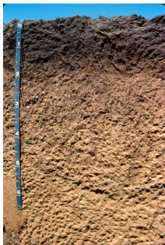
Figure 7. Sharpsburg series

Major soil series correlated to this ecological site include: Aksarben, Burchard, Morrill, Yutan and Shelby. Sharpsburg has been correlated to Aksarben in this MLRA.