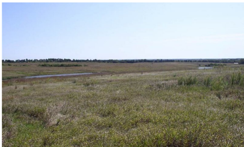
Figure 15. Martin Prairie - 50/50 brome/native mix

This plant community represents a shift from the reference state across a state threshold. With continued undermanaged grazing, little bluestem and cool-season introduced grasses increase. Smooth brome is the dominant invader in the northern half of the MLRA while tall fescue is common in the south. Kentucky bluegrass may be subdominant throughout. Continuous heavy grazing pressure will convert this plant community to a sodbound condition. Forb richness and diversity will decrease as well. Total annual production ranges from 2,100 and 3,100 pounds of air-dry herbage per acre per year, and produce about 2,600 pounds per acre in average years.