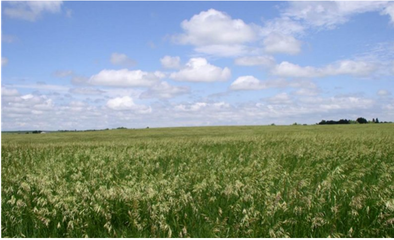
Figure 17. Smooth brome