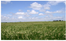
Bromus inermis , Schedonorus arundinaceus ; Smooth brome, Tall fescue)