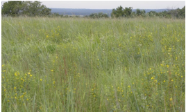
Andropogon gerardii - Sorghastrum nutans (Big bluestem-Indiangrass)