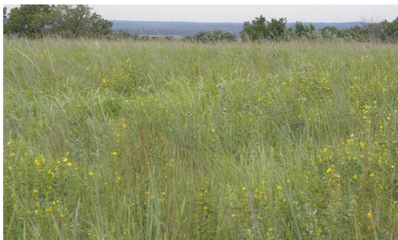
Figure 10. Rockefeller Prairie

This plant community is 75-90 percent grasses and grass-like plants, 5-10 percent forbs, and 0-10 percent shrubs, based upon total annual air-dry weight production. Big bluestem, Indiangrass, little bluestem, porcupine grass, sideoats grama, and switchgrass are the dominant species making up 70 percent or more of the total annual production. Blue grama, prairie junegrass, Scribner's rosette grass (panicum or panic grass), tall dropseed and various sedges, shrubs, and forbs are also important plants to the site (Kaul 2006, Steinauer 2010, USDA/NRCS 2012). This plant community is very stable but there is annual variability of expression of the dominant plant species based on current climate and local disturbances. Late spring fires will stimulate warm-season plants while suppressing cool-season grasses and forbs. This plant community is very stable with very little water runoff. The total annual production ranges from 2,975 to 5,400 pounds of air-dry lbs/ac depending on climate, with an average of 4,250 lbs/ac.