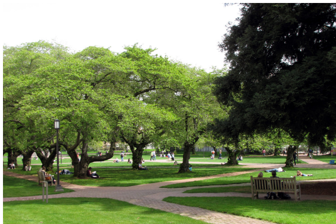
THE QUAD IN SPRINGTIME.