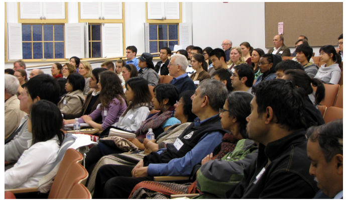
ATTENDEES AT THE 2010 NOBEL PRIZE LECTURE IN ECONOMICS.

The UWEAO hosts lectures on current topics in economics as well as networking events for alumni and students. The UWEAO's signature event is the Nobel Prize in Economics Lecture, presented each year by an Economics faculty member who explains the work of the prior year's Nobel Laureate. The lecture is a staple for the Department and a favorite of students and alumni alike. This year's lecture was given by Professor