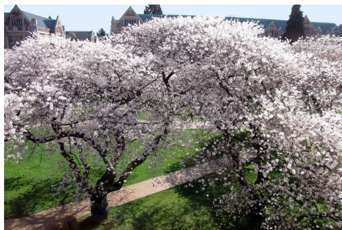
THE CHERRY TREES IN BLOOM, AS SEEN FROM SAVERY HALL.