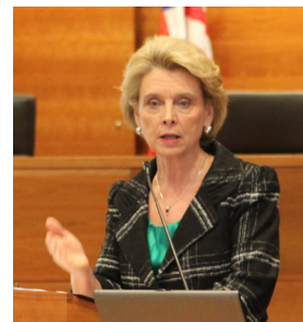
GOV. CHRISTINE GREGOIRE