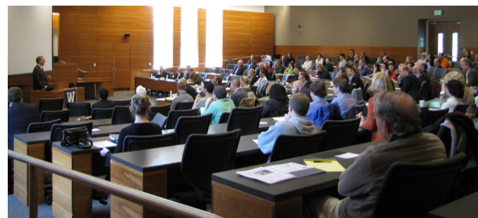
ATTENDEES AT THE EPRC CONFERENCE

The Economic Policy Research Center provides a forum for economic policy discussions vital to the Northwest, engaging public and private sector stakeholders with University of Washington faculty to clarify and improve economic content of public policy. The Center continues to serve as a resource to the region, providing access to policy design solutions for researchers and practitioners alike.