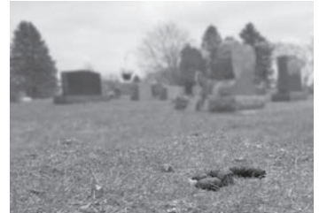
Pictured: one of many examples of dog owners disrespecting the deceased and Village ordinances.

Signs banning dogs will be posted on or around May 1. The