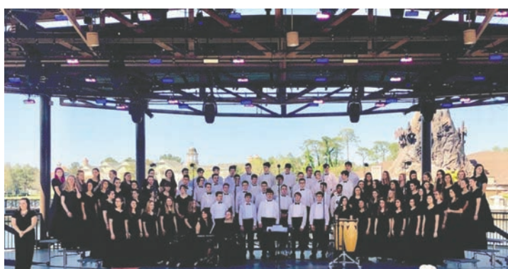
Kohler High School choir students take a bow after their performance at Disney World