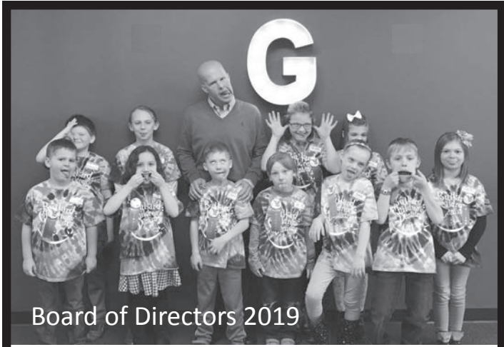
Board of Directors 2019