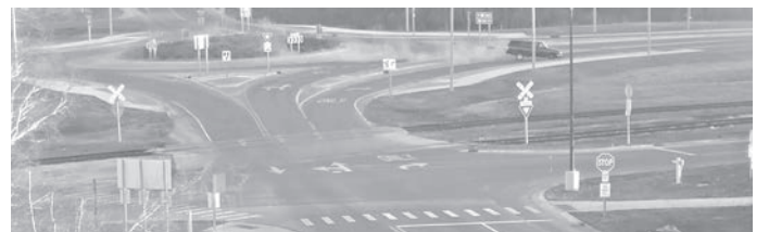
Drunk driver crashes at PP & A roundabout. See video online kohler.news in the March archives.