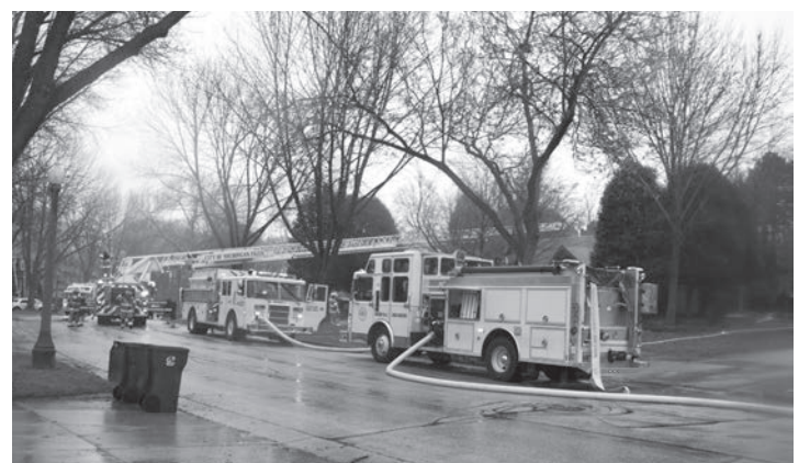
See more photos and video on kohler.news

Assisting Kohler police with traffic control were officers from the Sheboygan County Sheriff's Office and the City of Sheboygan Falls Police Department.