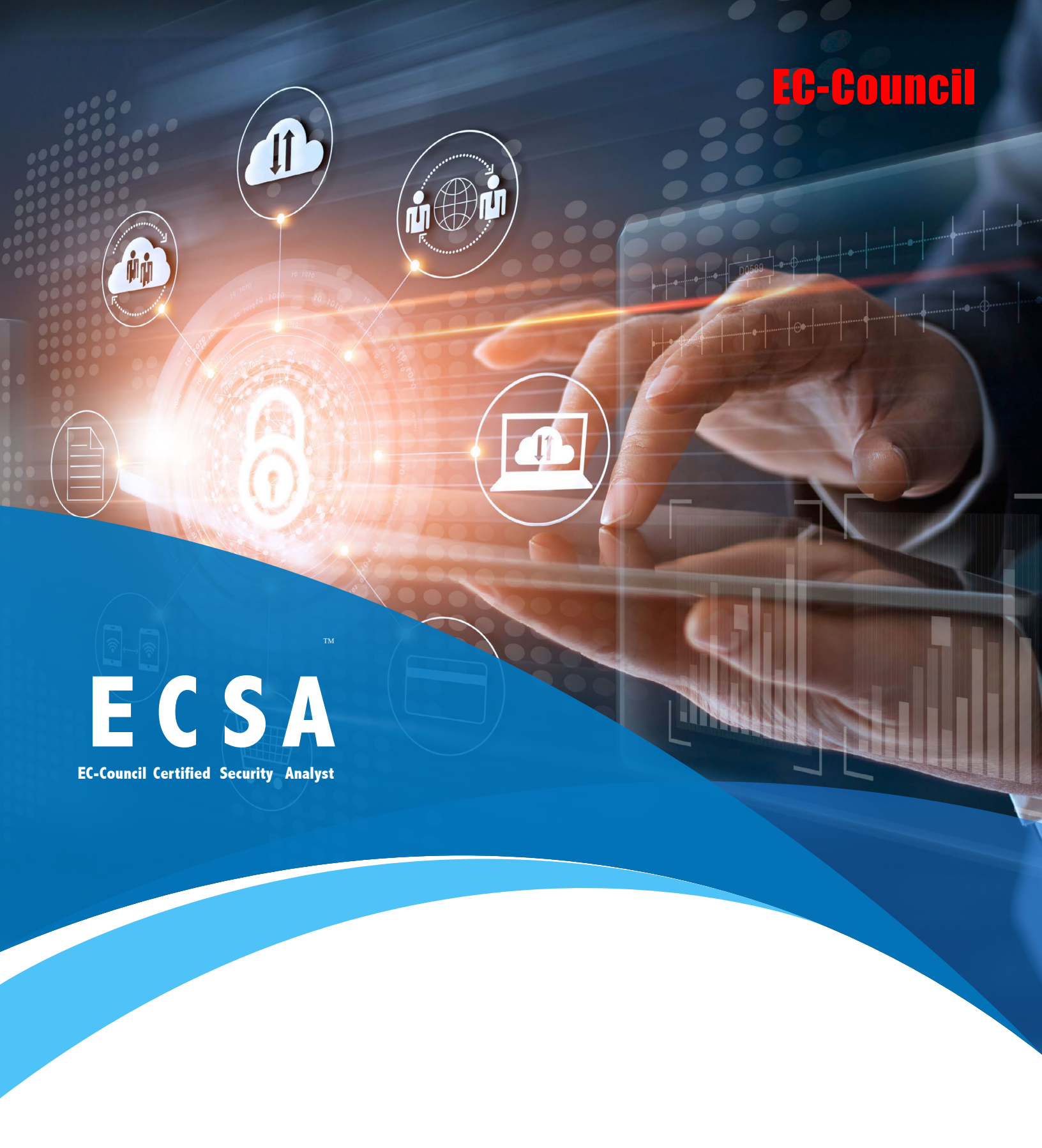
ECSA Exam Blueprint v2