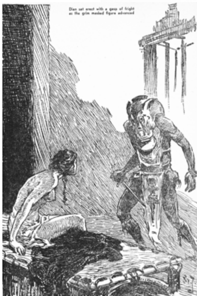
Dian sat aghast with a gasp of fright as the grim masked figure advanced

St. John certainly had a flair for illustrating flying dinosaurs as they twisted through the air.