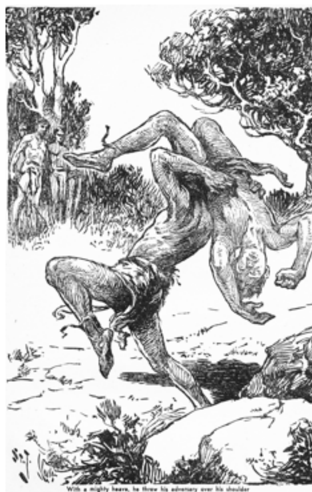
With a mighty heave, he threw his adversary over his shoulder

The fourth part of the book's quartet would not see print until decades later.