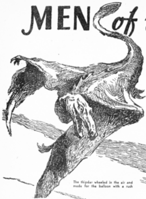
The tripod wheeled in the air and made for the balloon with a rush

It was a weird land indeed to which the runaway balloon bore Dian the Beautiful; to become its people's unwilling goddess