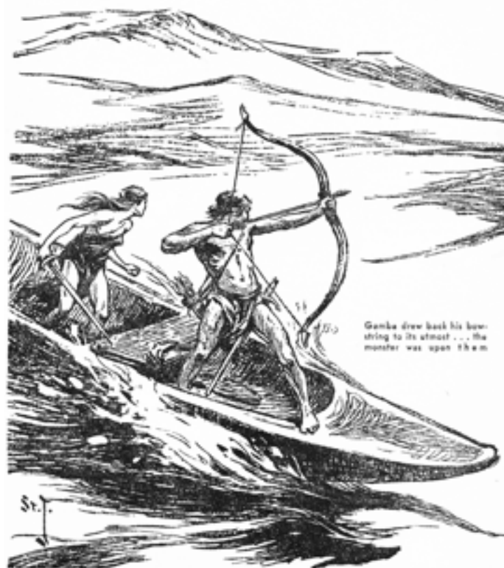
Gemba drew back his bow-string to its utmost . . . the monster was upon them

Into the Sea Of Nowhere sailed Dian and her captor. No one had ever sailed it before . . .