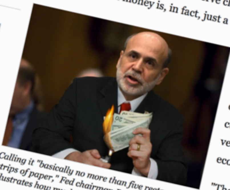
Calling it "basically no more than five rectangular strips of paper," Fed chairman Ben Bernanke illustrates how much "$200" is actually worth.

WASHINGTON—The U.S. economy ceased to function this week after unexpected existential remarks by Federal Reserve chairman Ben Bernanke shocked Americans into realizing that money is, in fact, just a meaningless and intangible social construct.