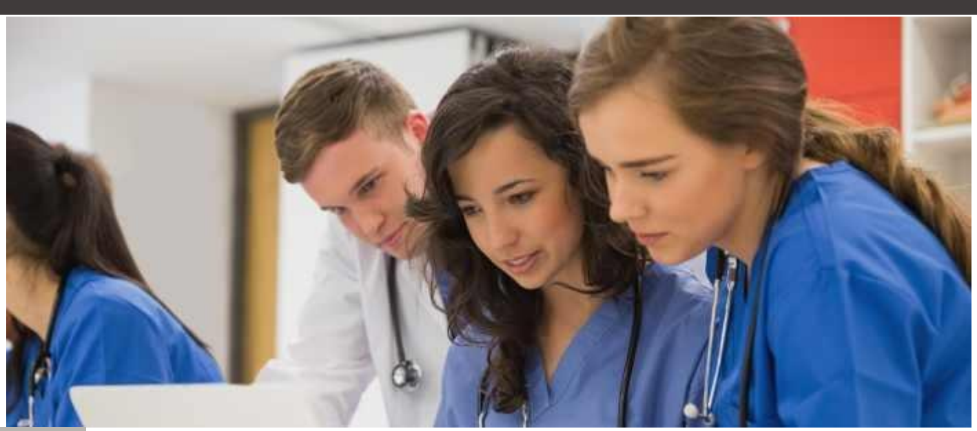
1PHP = 1.5 INR