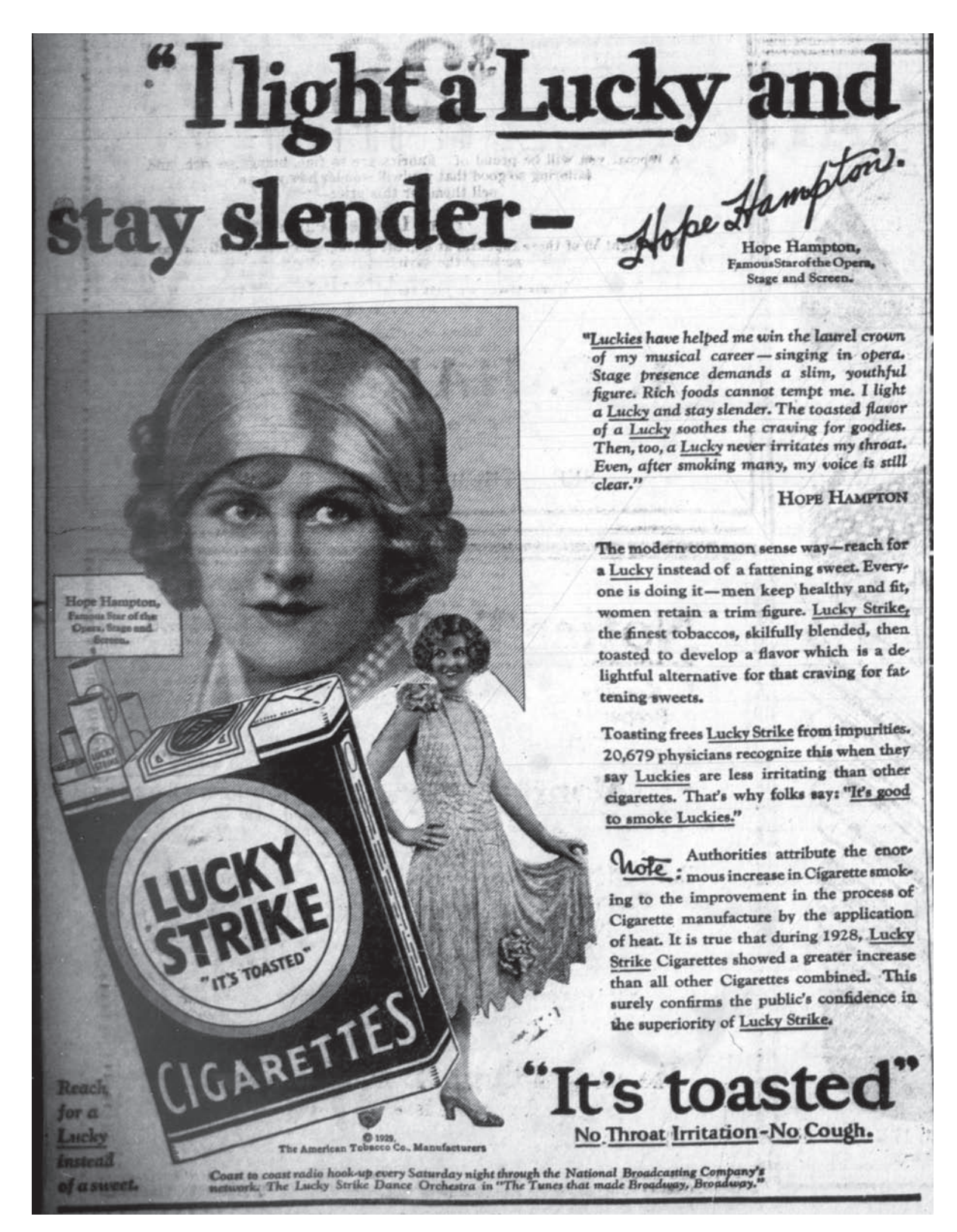
In 1929 there were slick cigarette ads in the El Dorado Times, just as though Kansas were New Jersey.