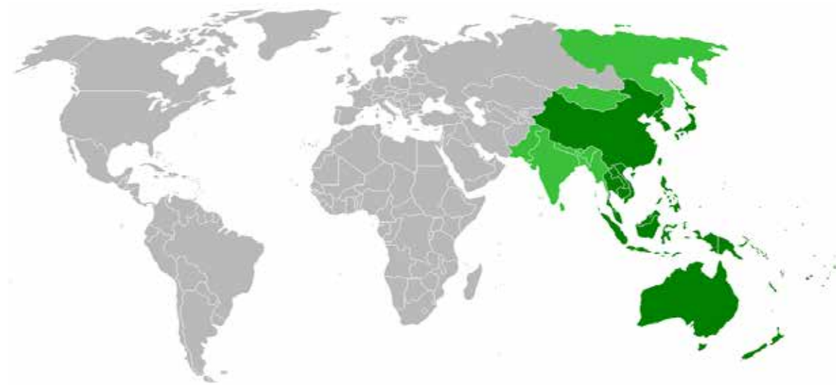
IMAGE: Map showing countries within the Asia-Pacific region. The definition of the region is fairly ambiguous

Gitanas Nausėda underlined the importance of maintaining an open dialogue among civilizations and close ties with Asian countries. The President said that “our nations are united by shared goals to better understand each