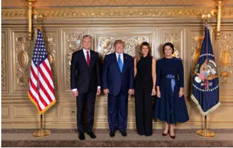
IMAGE: Lithuania hopes to maintain good relations with the U.S.

aggression in Ukraine. Deployment of Enhanced Forward Presence (EFP) multinational battalion-size battlegroups to the eastern part of the Alliance was one of them. What else is needed to strengthen deterrence in the region?