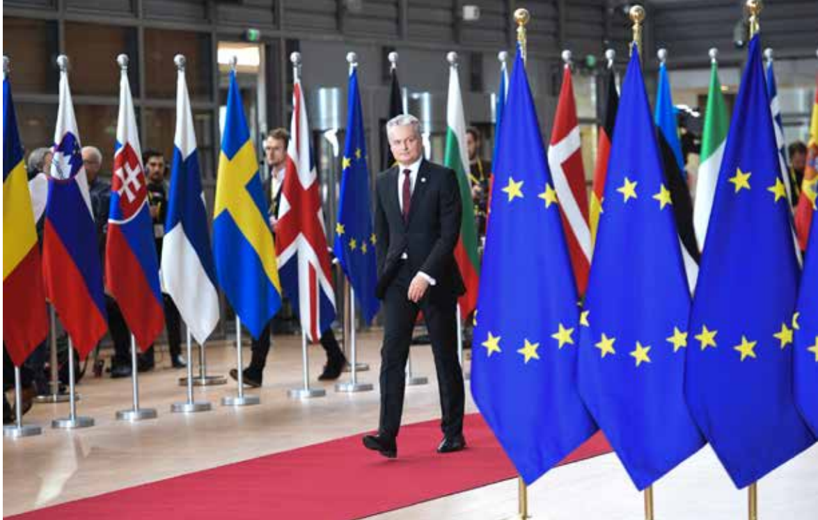
IMAGE: President Nausėda represents Lithuania in the European Council meetings

orientation and determination to introduce changes.