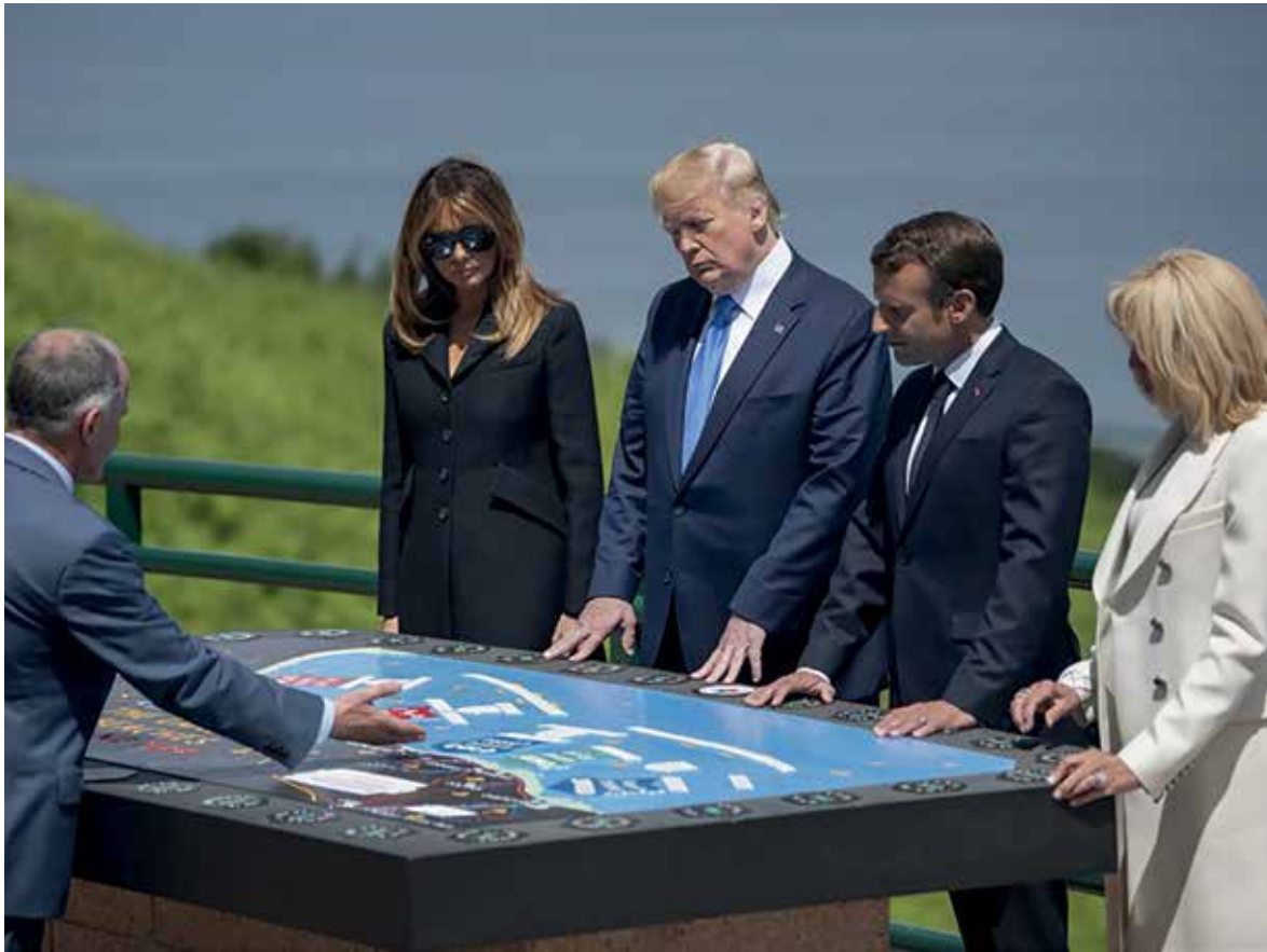
IMAGE: While the issue of European army is controversial, history unites both sides of the Atlantic. First Lady, Melania Trump; US President, Donald J. Trump; French President, Emmanuel Macron; and French First Lady, Brigitte Macron, with a member of the American Battle Monuments Commission study a map of the D-Day landings at an Omaha beach overlook during the commemoration ceremony of the 75th anniversary of D-Day at the Normandy American Cemetery and Memorial, June 6, 2019

many actors still tempted by a non-cooperative stance at home and abroad. All those objections are well documented and the tune is often played in Paris as well as in Berlin.