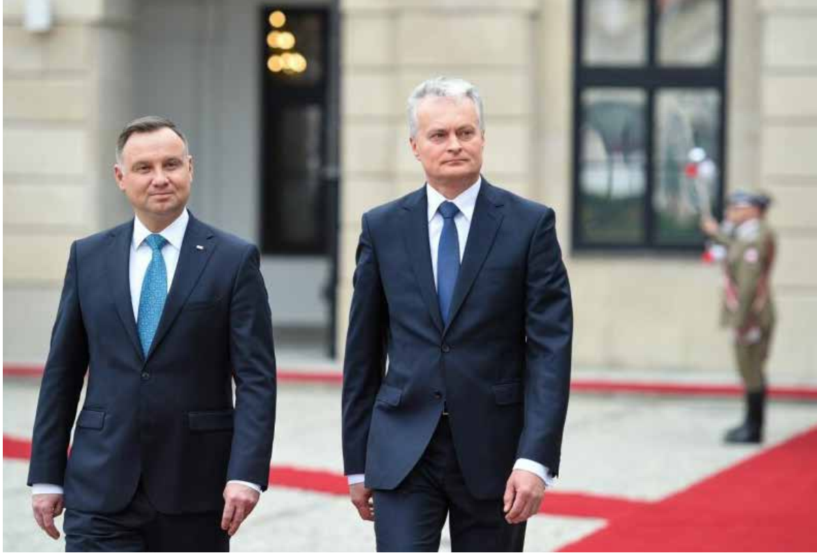
IMAGE: President of Poland, Andrzej Duda, and President of Lithuania, Gitanas Nausėda