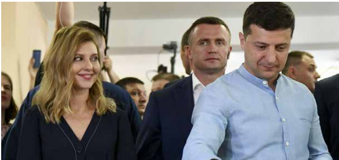
IMAGE: President of Ukraine, Volodymyr Zelenskyy, and his wife Olena, voting at the extraordinary elections of people's deputies of Ukraine