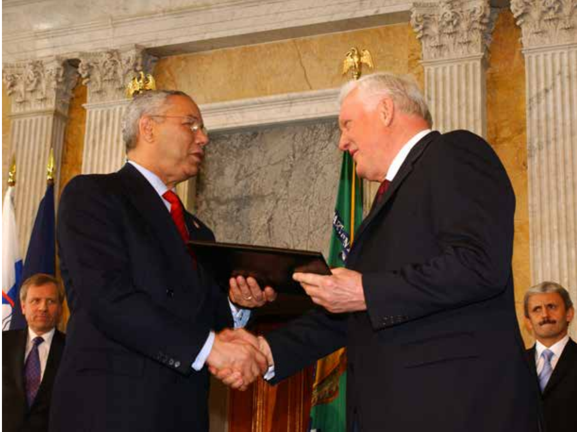
IMAGE: US Secretary of State, Colin Powell, and the Prime Minister of Lithuania, Algirdas Brazauskas, during the Accession Ceremony for Seven New NATO Members in 2004 in Washington D.C., US