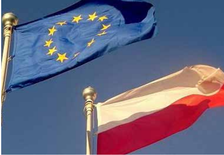
IMAGE: Polish relationship with EU remains somewhat ambivalent

when it comes to the diversification of gas and oil imports. The infrastructural projects of Poland and other Baltic states, which are being developed with the financial support of the European Union, are no less important – we are speaking about “ Via Baltica ” and “ Rail Baltica ” here, two projects that have been, up until now, marked by consistent delays.