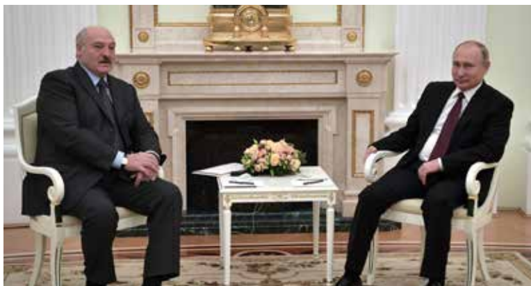
IMAGE: Russia and Belarus may enter a new phase of relationship

“There is a reason why Russians talk about nuclear weapons all the time – it is so that every foreign minister, defense minister, prime minister, member of parliament, member of Congress thinks that, they would actually use nuclear weapons and that they practice nuclear scenarios and all the related exercises. They don't make up some artificial locations: they talk about Warsaw, they name actual cities in the West as targets. Then you have their ambassadors to Denmark, a country that will