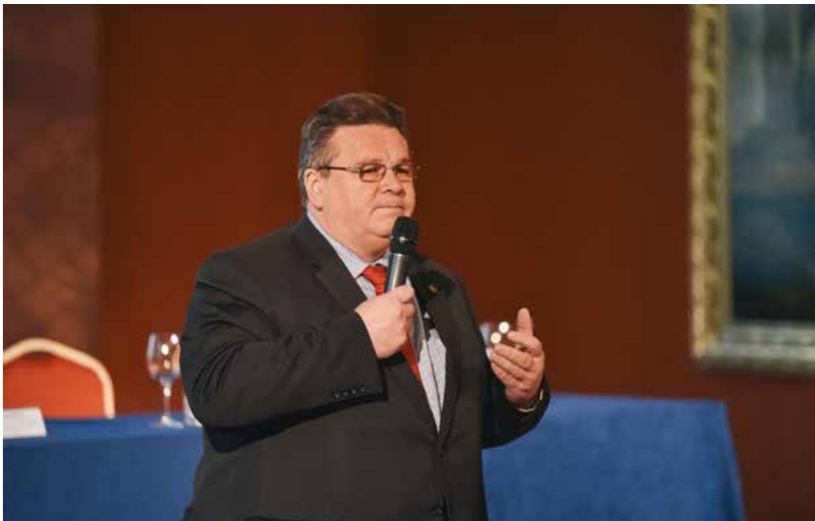
IMAGE: Minister of Foreign Affairs of the Republic of Lithuania Linas Linkevičius