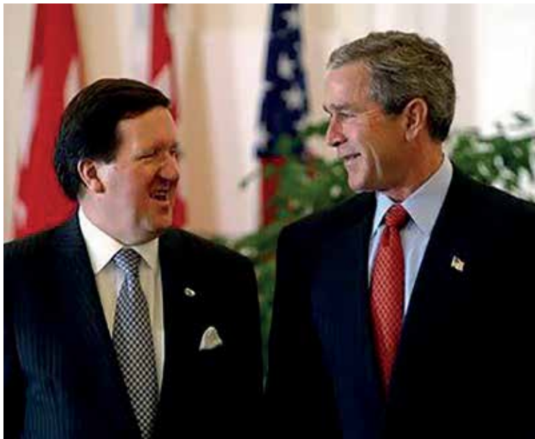
IMAGE: President George W. Bush talks with NATO Secretary General Lord George Robertson at the beginning of the North Atlantic Council Summit in Prague, Czech Republic, Thursday, Nov. 21, 2002.

NATO is already making moves to close the gap with the disrupters. Focus on cyber and hybrid