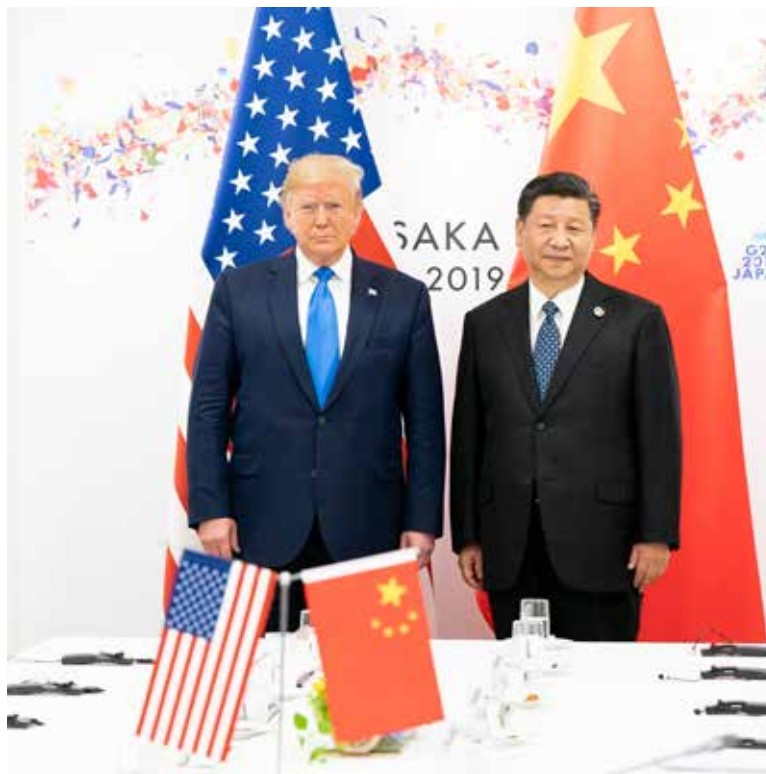
IMAGE: President Donald J. Trump joins Xi Jinping, President of the People’s Republic of China, at the start of their bilateral meeting Saturday, June 29, 2019, at the G20 Japan Summit in Osaka, Japan

The West’s folly has extended to the growth of the Internet, a lawless space which defies the ability of mankind to govern. Precisely because the technology was never designed to be governable. Individual liberty, rule of law, private property and sovereignty all require an enforcement mechanism. America’s founders believed the