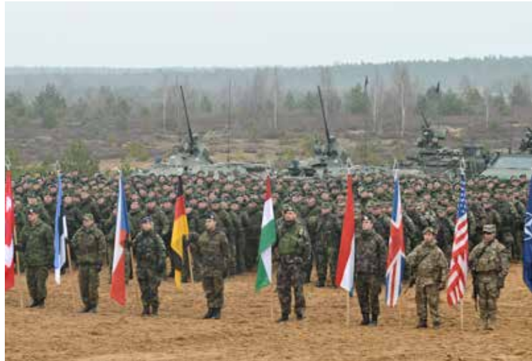
IMAGE: NATO allies in military exercises

After seventy years NATO is as strong and relevant as it ever was and still is the cornerstone of the defence of its member states. We all have a right to celebrate the