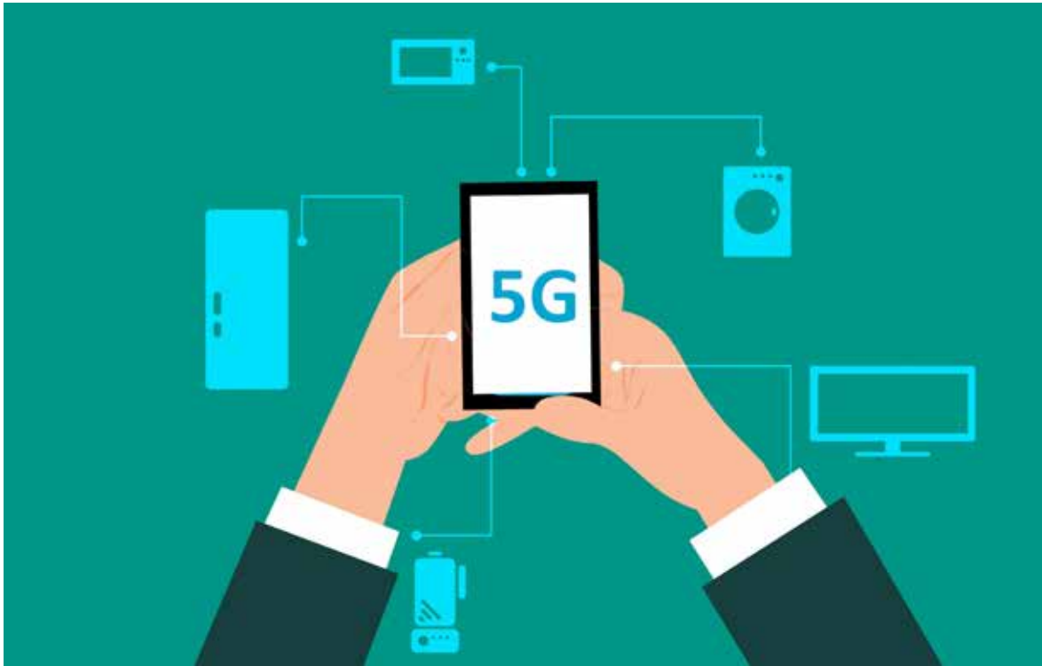
IMAGE: 5G development remains a contentious issue in US-China relations

allows for large data aggregators to do things that are contrary to the national interest without giving the government the means to reassert the rule of law. Totalitarian regimes are free then to use that same separation and private profit motive to gain assistance from those same technology companies to harness the power of data for their illiberal ends.