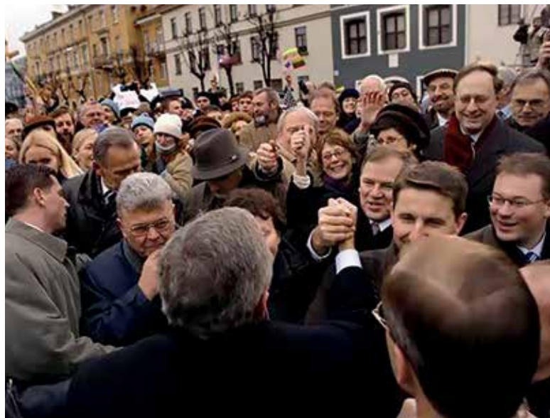
IMAGE: President George W. Bush greets Lithuanians in person at the Rotuse Square in the center of Vilnius, Lithuania, Nov. 23, 2002. “This is a great day in the history of Lithuania, in the history of the Baltics, in the history of NATO, and in the history of freedom,” said President Bush in his remarks. “And I have the honor of sharing this message with you: We proudly invite Lithuania to join us in NATO, the great Atlantic Alliance.”

most successful defence alliance ever. But to ensure that it remains a success for the next seventy years we need to invest now in