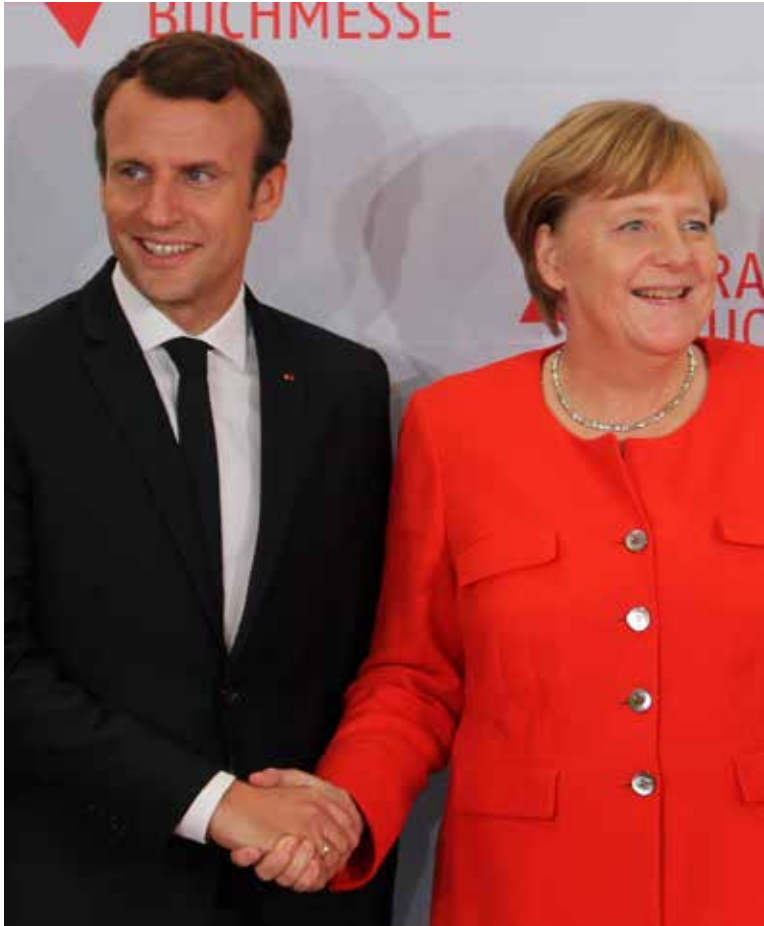
IMAGE: French President Emmanuel Macron and German Chancellor Angela Merkel are supportive of the idea of a European Army

States have reached that level. It is now the turn for Germany, France, etc. Even from the US perspective, NATO can no longer be the only life insurance of the European Member States.