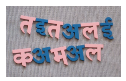
Figure 2. Titli (butterfly) and kamal (lotus) with unnecessary vowels

Using these symbols, children are taught to create Hindi words. Due to the presence of an inherent schwa in Devanagari, it is possible to create some words using the base symbols without adding a vowel; for example, the word kamal can be created from three symbols -k, m, and l – but this approach ignores this inherent vowel. Instead, children are taught to form the word kamal by adding vowels and end up with an incorrect word – kaamaal (see Figure 2).