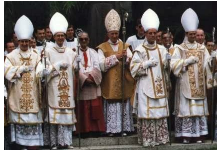
Archbishop Lefebvre and our four bishops